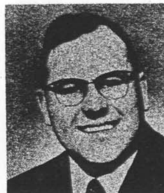
ROBERT L. HOWSAM President

Already classed as minor league baseball's most successful independent operator, Bob Howsam became one of the original founders of the American Football League. A man who exemplifies the best in the American tradition of building, he has erected a sports empire in the Rocky Mountain empire unparalleled in the annals of local history.