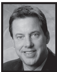
WILLIAM CLAY FORD, JR.