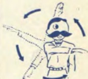
12. No Time-Out or Time-In with Whistle