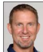
MIKE NOWAK Team Photographer