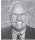
Jim Edmonds Comcast SportsNet