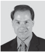
Sean Grande WEEI