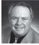
Tommy Heinsohn