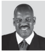
Cedric Maxwell