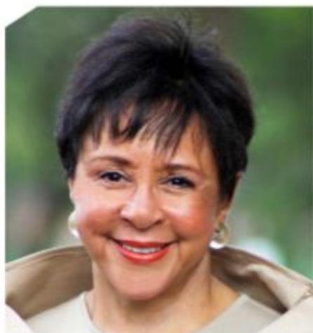
Sheila C. Johnson

Sheila C. Johnson is a successful entrepreneur and impassioned philanthropist. As a partner in Lincoln Holdings, Ms. Johnson is the only African-American woman to have ownership in three professional sports teams, the WNBA's Washington Mystics, the NBA's Washington Wizards and the NHL's Washington Capitals. Ms. Johnson is President and Managing Partner of the Mystics.