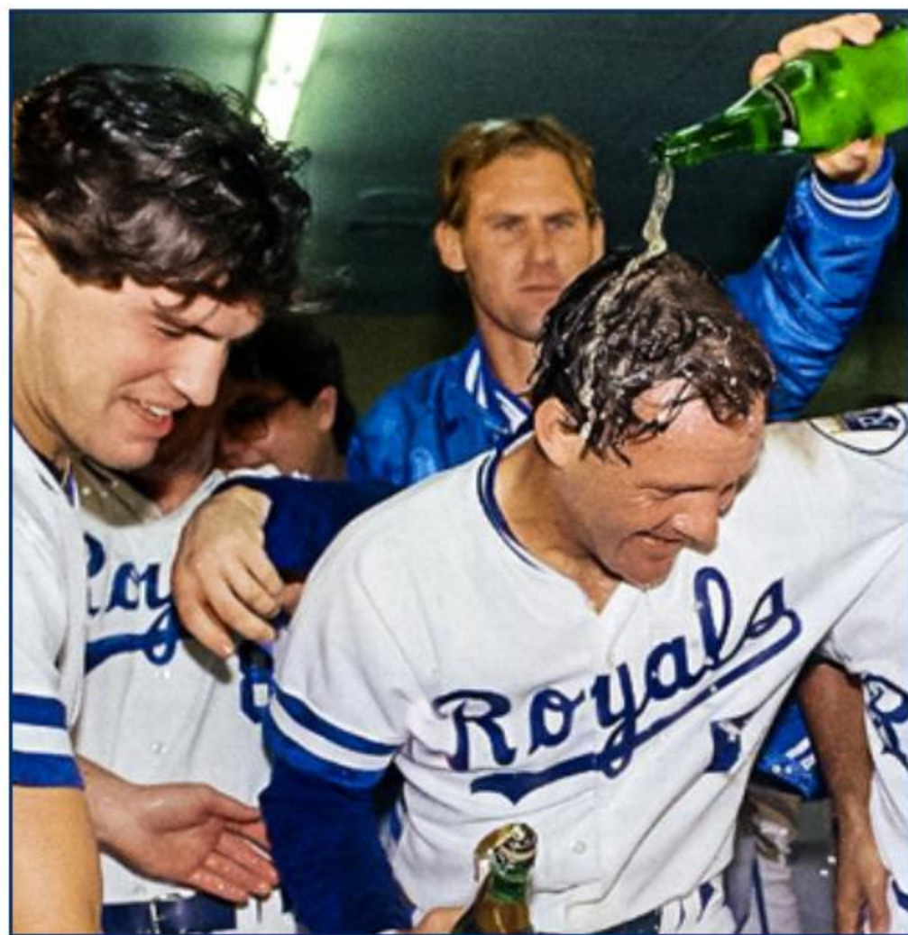
Jamie Quirk pours champagne over George Brett after winning the 1985 World Series.