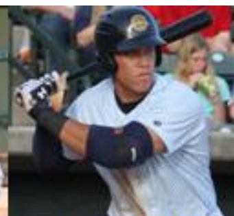
AARON JUDGE 2014