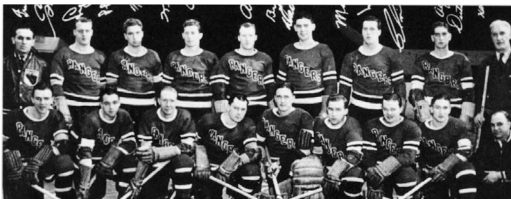
1939-40 — Standing (Left to Right)-Frank Boucher (Coach), Lynn Patrick, Neil Colville, Ott Heller, Art Coulter (Captain), Babe Pratt, Muzz Patrick, Alf Pike, Lester Patrick (Manager). Bottom Row (Left to Right)-Alex Shibicky, Phil Watson, Kilby MacDonald, Bryan Hextall, Dave Kerr, Mac Colville, Clint Smith, Dutch Hiller, Harry Westerby (Trainer).