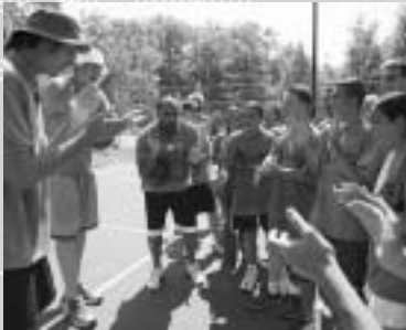
THROUGH THEIR CHARITABLE WORK, NBA PLAYERS SUCH AS BRENT BARRY (LEFT) MAKE A DIFFERENCE FOR NONPROFITS AND YOUTH-SERVING ORGANIZATIONS.

As the world's greatest athletes, NBA players are also dedicated to the community and committed to giving back in extraordinary ways. Through their foundations, camp efforts and charitable work, they make a difference for hundreds of nonprofit and youth serving organizations. To honor players' outstanding community service accomplishments off the court each month, the NBA recently enhanced its Community Assist Award by announcing that all future winners would receive the David Robinson Plaque. The new award was first presented to the San Antonio Spurs legendary center last season to honor him for the standards he has set in supporting the community. The NBA and WNBA also present an annual Sportsmanship Award to one player at the conclusion of their respective seasons.