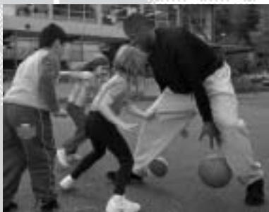
THROUGHOUT THE YEAR, RAY ALLEN AND HIS SONICS TEAMMATES CONDUCT CLINICS AND EVENTS THAT TEACH, ENCOURAGE AND MOTIVATE KIDS.

scores and expands their love of books. Each month, thousands of students across the state return Sonics Read To Achieve 20/20 charts to their school librarians and become eligible to win special Sonics prizes. Last year, the program reached nearly 60,000 students at 160 schools across the state of Washington.