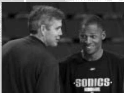
SONICS PRESIDENT AND CEO WALLY WALKER (LEFT) WELCOMED RAY ALLEN TO THE TEAM'S ROSTER LAST FEBRUARY.