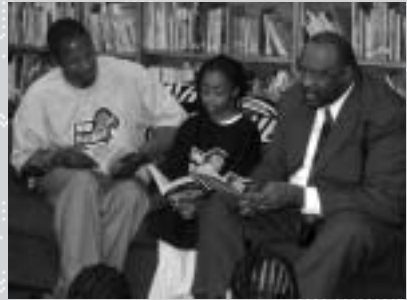
ALONG WITH NBA GREAT BOB LANIER (RIGHT), SONICS GUARD RAY ALLEN HAS OPENED BOOKS AS WELL AS THE 'READ TO ACHIEVE' PROGRAM TO AREA STUDENTS.

In addition to youth education, the NBA also supports numerous causes and organizations that positively impact communities including The Thurgood Marshall Scholarship Fund, UNICEF, The National Wheelchair Basketball Association, The National Civil Rights Museum, Gallaudet University and The National Underground Railroad Freedom Center.