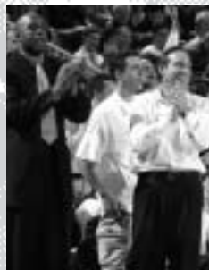
CLUB CHAIRMAN HOWARD SCHULTZ (RIGHT) RECENTLY TOOK IN A SONICS GAME WITH NBA LEGEND EARVIN 'MAGIC' JOHNSON.

The Basketball Club of Seattle is the third owner of the SuperSonics, which