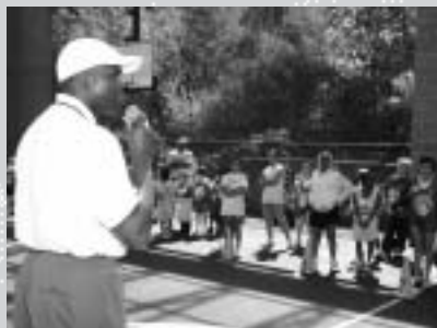
SONICS HEAD COACH NATE McMILLAN FREQUENTLY TAKES PART IN T.E.A.M. EVENTS TO INSPIRE KIDS IN THE COMMUNITY.

For more information on the Sonics community efforts, visit SUPERSONICS.COM .