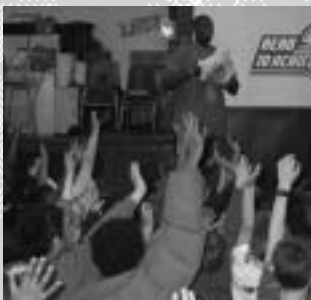
NEARLY 60,000 STUDENTS ACROSS WASHINGTON PARTICIPATED IN THE SONICS 'READ TO ACHIEVE' PROGRAM LAST SEASON.

Knowing that combining a healthy body with a healthy mind achieves great things, the Sonics have again joined forces with Gatorade and Golden Grain/Mission Pasta to provide incentives for Seattle's students to stay in shape. Through the Sonics Hip To Be Fit program challenge, students who achieve the nation's 85th percentile or above on the President's Fitness Challenge in five activity categories receive a Hip To Be Fit T-shirt and an opportunity to be recognized as a fitness leader at a Sonics game. Schools with the highest level of achievement or improvement in the Hip To Be Fit challenge are eligible for a school assembly featuring a Sonics player.