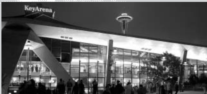
OPENED IN 1995, KEYARENA IS HOME TO THE SEATTLE SUPERSONICS.