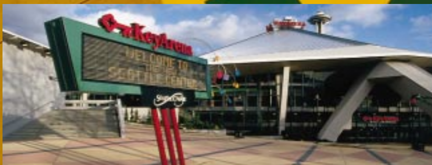
THE SONICS PLAYED THEIR FIRST GAME AT KEYARENA AGAINST THE L.A. LAKERS ON NOV. 4, 1995.