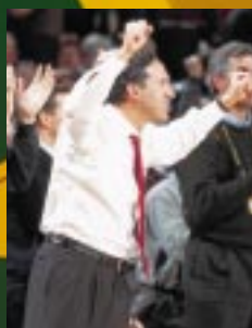
LONGTIME SONICS FAN AND TEAM OWNER HOWARD SCHULTZ CHEERS ON HIS TEAM AT KEYARENA.

The Basketball Club of Seattle is the third owner of the SuperSonics, which