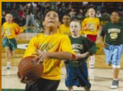
THROUGHOUT THE YEAR, THE SONICS HOST EVENTS AND CLINICS TO HELP TEACH, ENCOURAGE AND MOTIVATE KIDS IN THE COMMUNITY.

students in improving their reading skills. By encouraging students to read 20 minutes a day for 20 days each month, Read To Achieve improves students reading scores and expands their love of books. Each month, thousands of students across the state return Sonics Read To Achieve 20/20 charts to their school librarians and become eligible to win special Sonics prizes. Last year, the program reached nearly 60,000 students at 160 schools across the state of Washington.