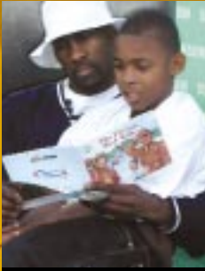
GARY PAYTON SHARES A BOOK WITH A FRIEND DURING A 'READ TO ACHIEVE' EVENT.

In recognition of the community outreach and commitment to service of our players, the league has established the Community Assist Award, which honors players whose efforts in the community are truly outstanding. To honor the NBA player that reflects the passion the league and its players have for their communities, all 29 NBA teams nominate a player for the Community Assist Award which is presented monthly throughout the year.