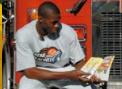
DESMOND MASON, WHO RECENTLY READ TO STUDENTS AT A SEATTLE FIRE STATION, MAKES THE 'READ TO ACHIEVE' PROGRAM A PRIORITY OFF THE COURT.

Awarded annually at the conclusion of each league's regular season, the NBA and WNBA Sportsmanship Awards recognize players who embody the spirit of sportsmanship. The NBA makes a $25,000 donation on behalf of the NBA Sportsmanship Award honoree, and a $10,000 donation on behalf of each of the three divisional awardees, to the charitable organization of their choice.