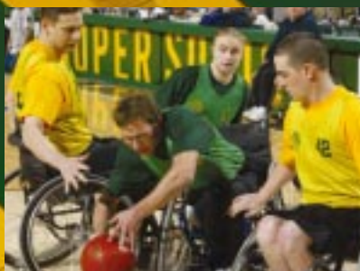
THE SONICS & STORM T.E.A.M. FOUNDATION SUPPORTS PROGRAMS THROUGHOUT THE COMMUNITY SUCH AS WHEELCHAIR BASKETBALL.

Every year, the Sonics encourage fans to donate cans of food, winter clothing and toys as they enter KeyArena at designated Sonics games throughout the season. This year the Sonics will also join forces with The CeaseFire Foundation to collect toy guns at a selected home game.