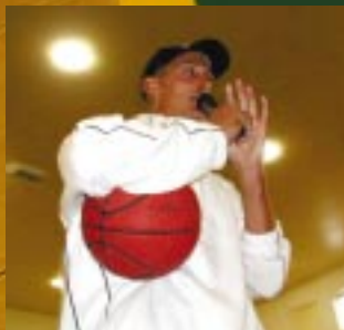
SONICS GUARD BRENT BARRY FREQUENTLY DELIVERS WORDS OF ENCOURAGEMENT TO STUDENTS AT SCHOOL ASSEMBLIES.

students in improving their reading skills. By encouraging students to read 20 minutes a day for 20 days each month, Read To Achieve improves students reading scores and expands their love of books. Each month, thousands of students across the state return Sonics Read To Achieve 20/20 charts to their school librarians and become eligible to win special Sonics prizes. Last year, the program reached nearly 60,000 students at 160 schools across the state of Washington.