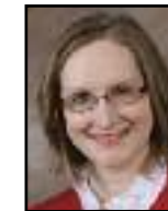
Jennifer Jackson Museum