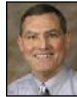
Pat Daly Event Services