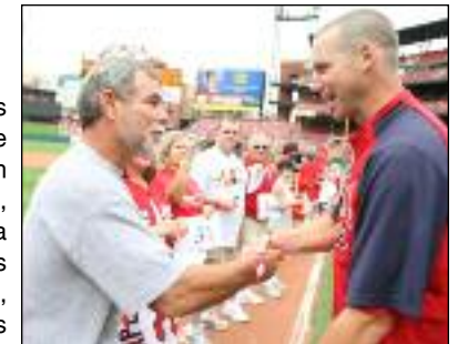
Pitcher Chris Carpenter gives an autographed jersey to a fan who purchased a winning raffle ticket during a Cardinals game.

The annual Winter Warm-Up and Jerseys Off Our Backs days are major fundraising initiatives for Cardinals Care which combine an opportunity for the fans to interact with players while donating to a great cause. In August 2010, the inaugural Run Home for Kids 6K was introduced as a unique philanthropic experience. Thanks to the generous assistance of our players, coaches, staff, volunteers, sponsors and especially our loyal fans, these events continue to be a tremendous success.