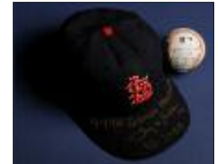
Tony LaRussa's cap and ball.