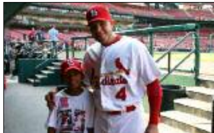
The Rookies Readers program offers a grand prize of meeting a Cardinals player like Yadier Molina and playing a game at Busch Stadium.