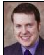
Brian Finch Museum