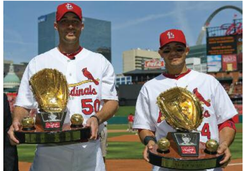
Pitcher Adam Wainwright and catcher Yadier Molina were National League Rawlings Gold Glove winners at their positions in 2009.