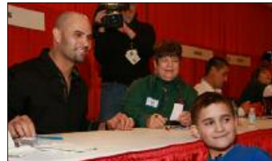
Fan favorite Albert Pujols always draws a lot of attention at the Winter Warm-Up, held downtown every year during Martin Luther King Jr. weekend.