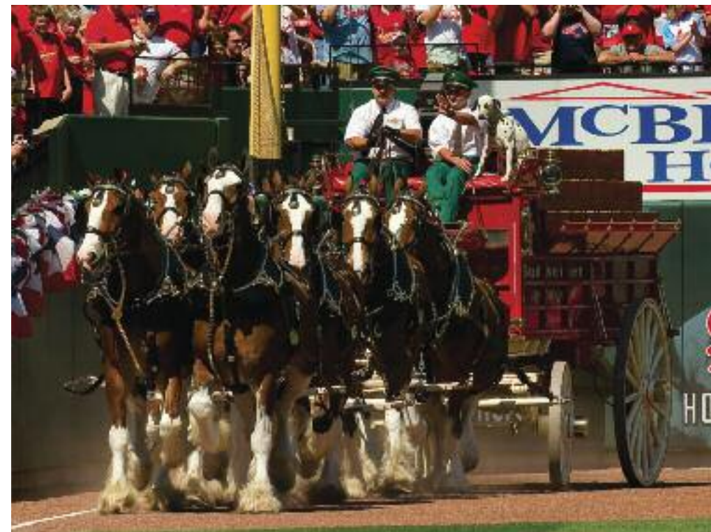
The Budweiser Clydesdales are an annual tradition in St. Louis, making appearances on Opening Day and special occasions.