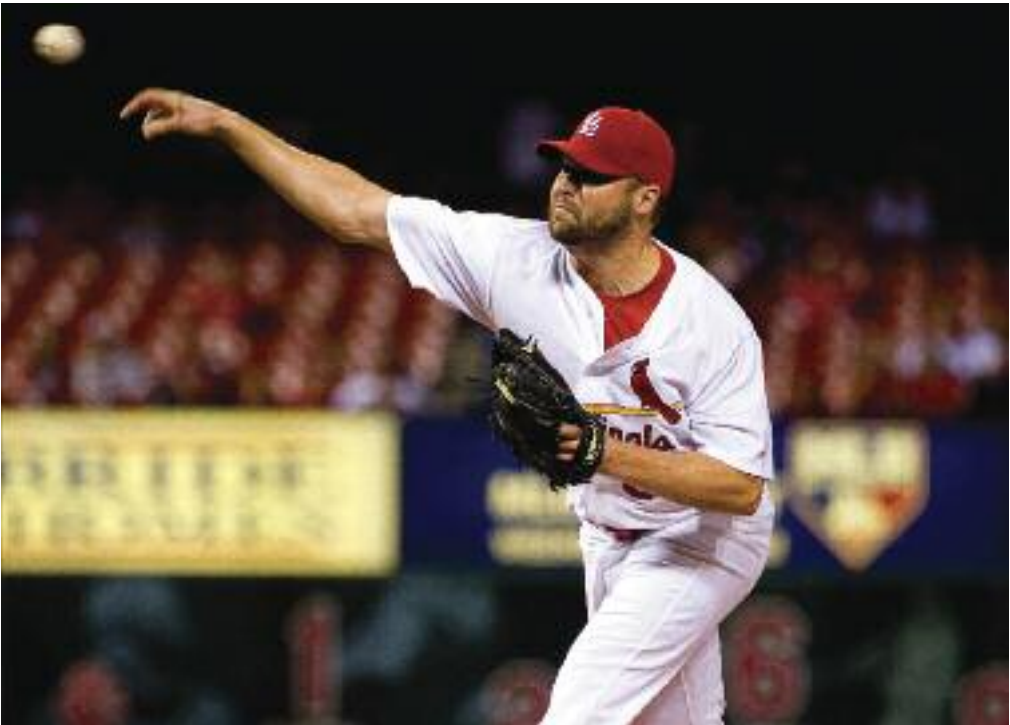
Pitcher Jake Westbrook joined the Cardinals rotation on July 31, 2010, and made 12 starts down the stretch. He became a free agent at season's end, but signed a two year contract to return to St. Louis on November 16.