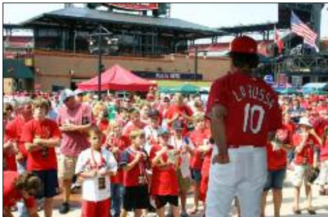
Kids Crew members get exclusive access to meet players and ask Tony La Russa the tough questions—like his favorite ice cream flavor!

This special fan club just for kids 15 and under includes game tickets, unique promotional items, an end-of-season members-only party at Busch Stadium and much more! Sign-up your favorite fan online at cardinals.com/kidsclub or at any home game.