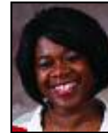
Hope Baker Stadium Operations