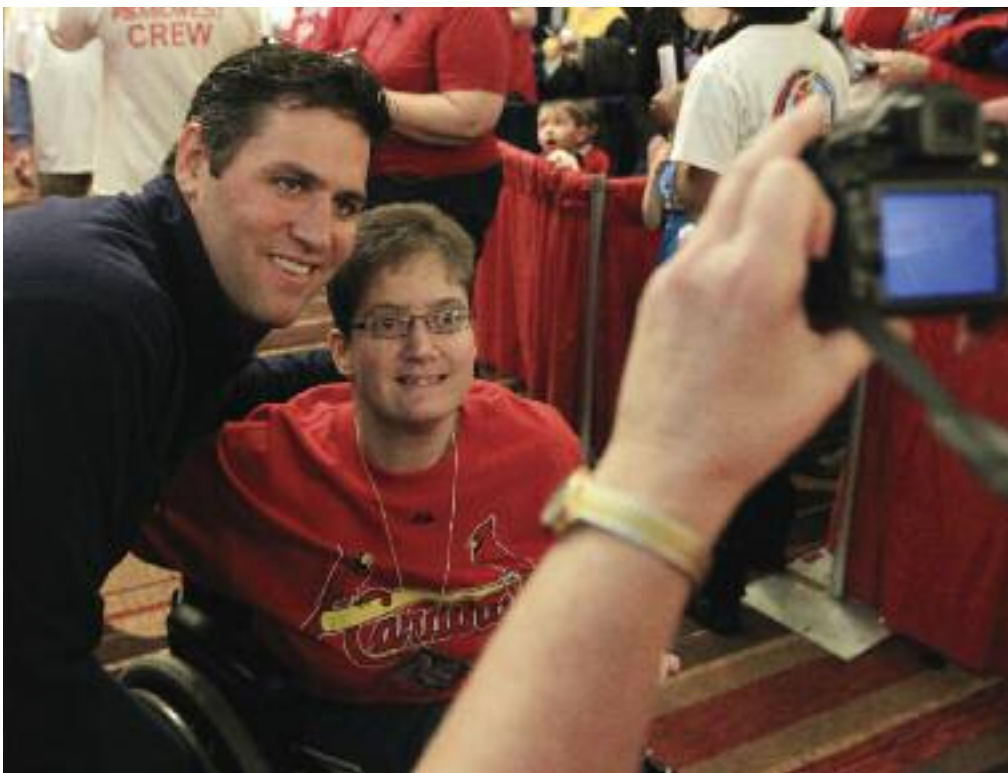
After signing as a free agent on December 5, 2010, Lance Berkman made his first appearance as a Redbird at the team's annual Winter Warm-up on January 15, 2011. Cardinals fans were thrilled to have the "Big Puma" playing for St. Louis instead of against them.