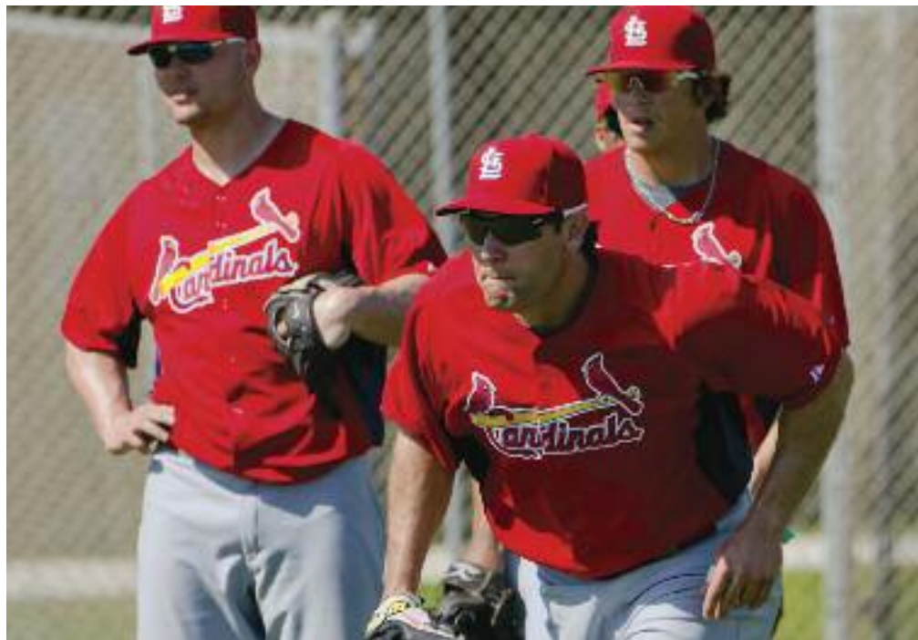
New Cardinals rightfielder Lance Berkman takes part in spring drills as fellow outfielders Matt Holliday and Colby Rasmus look on.