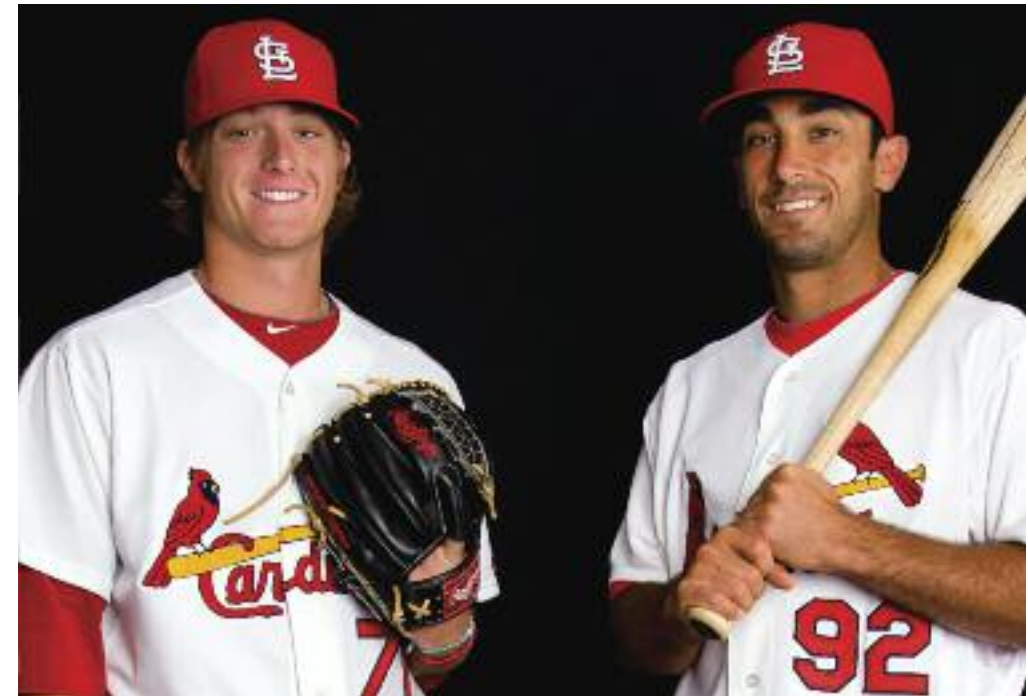
The 2010 Cardinals Minor League Pitcher of the Year, Shelby Miller, and Player of the Year, Matt Carpenter.