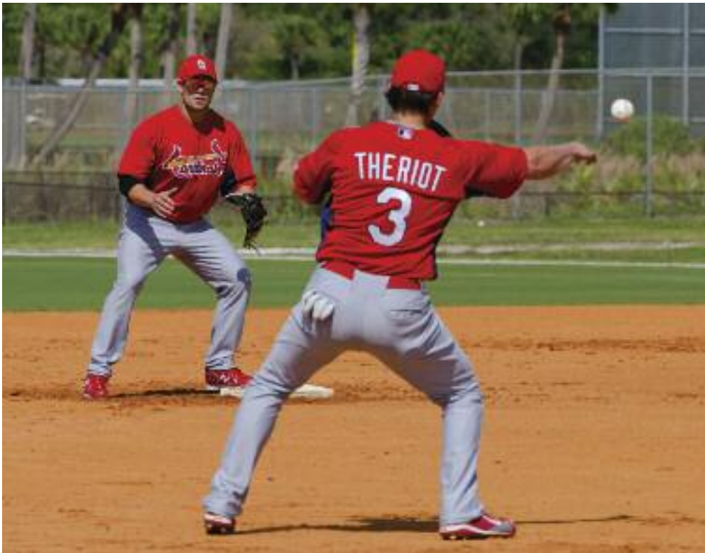
Ryan Theriot, who was acquired by the Cardinals this off-season, will combine with second baseman Skip Schumaker to cover the middle infield for St. Louis in 2011.