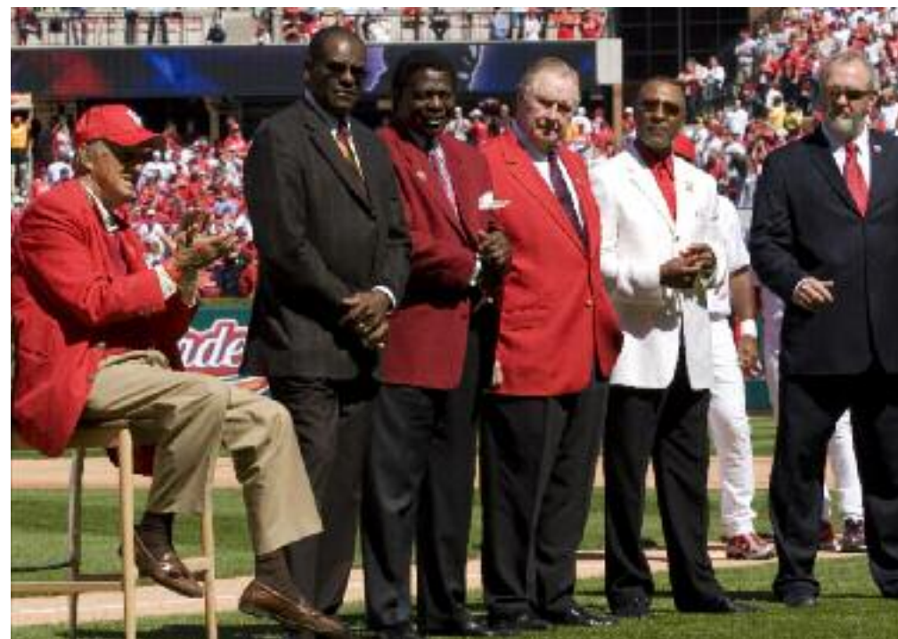
Hall of Famers Stan Musial, Bob Gibson, Lou Brock, Red Schoendienst, Ozzie Smith and Bruce Sutter (L-R) highlight pregame ceremonies before the first game at Busch Stadium on April 10, 2006.