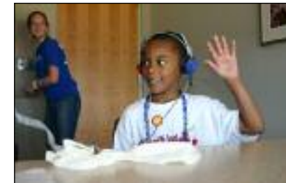
Each Rookie receives free vision, hearing and asthma screenings. In addition, they also get fitted for a complimentary bike helmet.