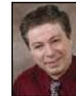
Tom Klein Publications