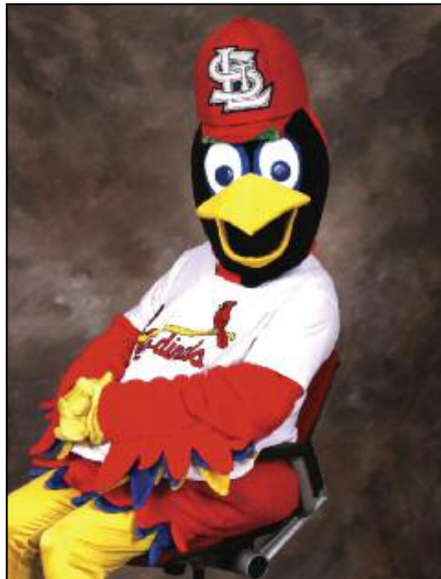
Fredbird Team Mascot