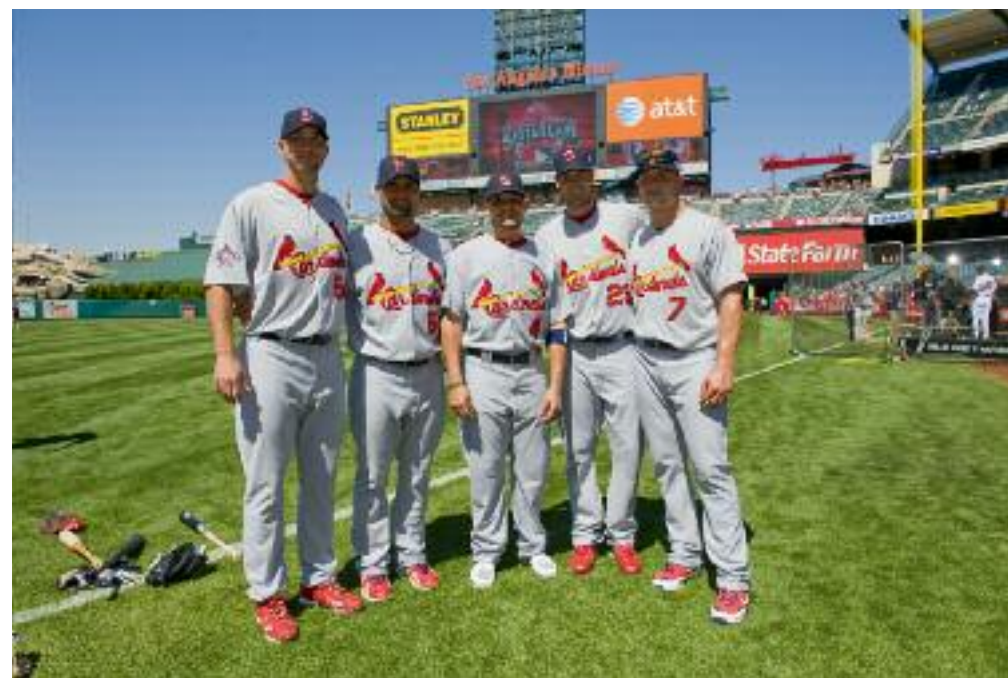
The St. Louis Cardinals were represented by five players (L-R) Adam Wainwright, Albert Pujols, Yadier Molina, Chris Carpenter and Matt Holliday at the 2010 All-Star Game in Anaheim, California.

*Denotes rookie. NOTE: Kurowski replaced Bob Elliott of Boston on the 1947 squad, Javier replaced Bill Mazerowski of Pittsburgh in 1963, Clayton replaced Barry Larkin of Cincinnati on the 1997 team, Renteria replaced Mark McGwire on the 2000 team and Houston's Morgan Ensberg replaced Scott Rolen in 2005. In 2006, David Eckstein replaced New York's Jose Reyes on the roster.