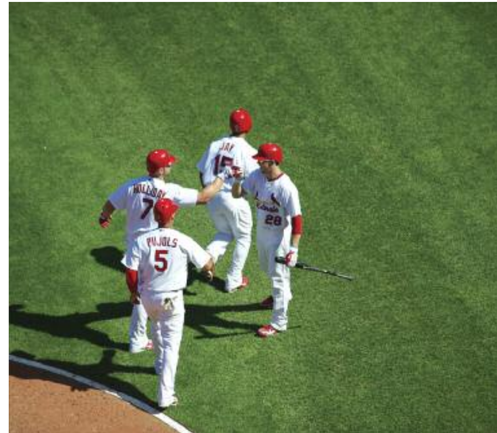
Colby Rasmus greets teammates Jon Jay, Matt Holliday and Albert Pujols at homeplate.