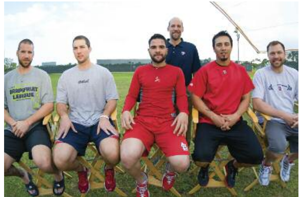
MLB Network announcer and former Cardinals pitcher John Smoltz, stopped by Spring Training to talk to Cardinals starters Chris Carpenter, Adam Wainwright, Jaime Garcia, Kyle Lohse and Jake Westbrook.