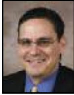
Sig Mejdal Baseball Operations