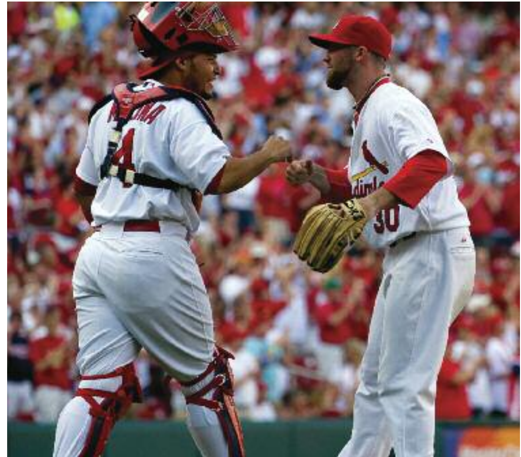
Cardinals catcher Yadier Molina and reliever Jason Motte celebrate a Cardinals victory.