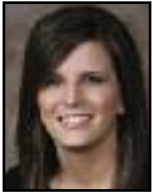
Ashly Moore Stadium Operations