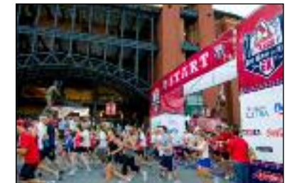
The Run Home for Kids 6K honored Stan 'The Man' Musial, allowed fans to finish on the field at Busch Stadium and raised over $150,000 for kids.