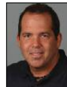
RIP ROWAN EQUIPMENT MANAGER