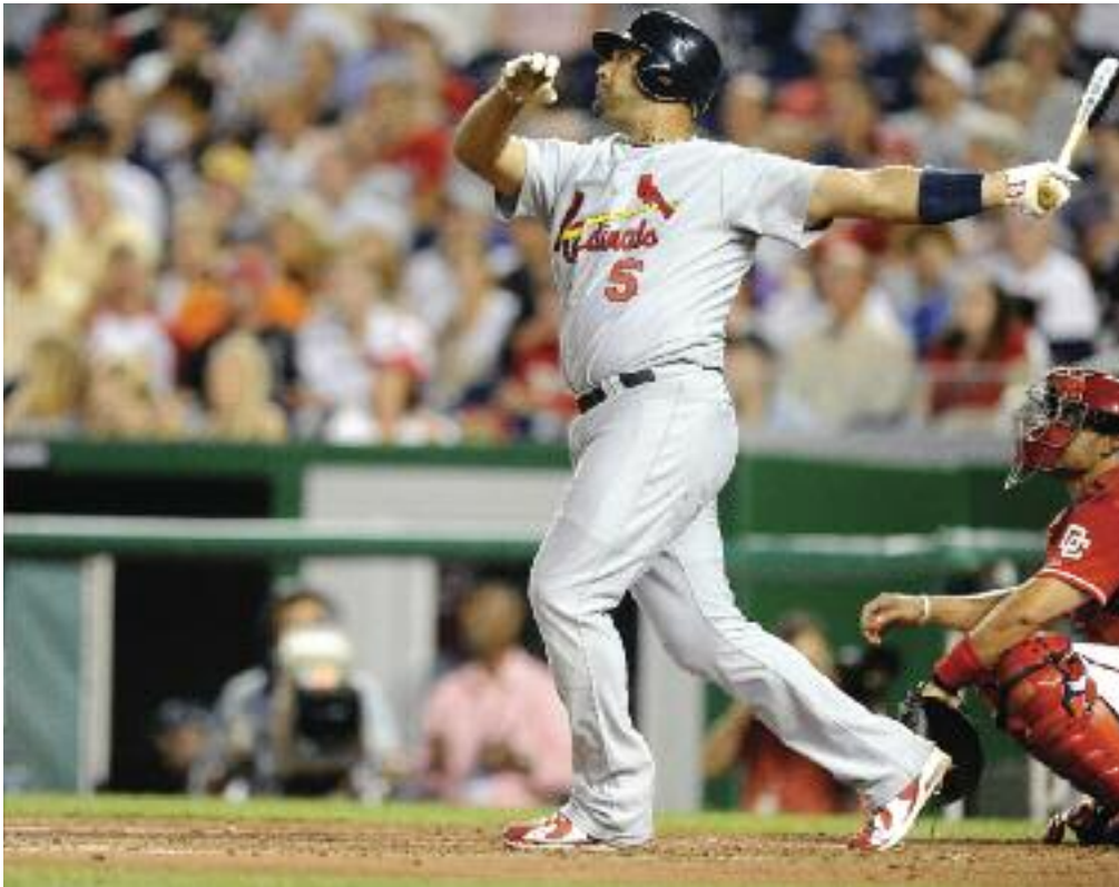
Albert Pujols had hit 408 home runs as a Cardinal at the start of the 2011 season, joining Stan Musial (475) as the only Cardinals to have reached the 400 home run plateau.