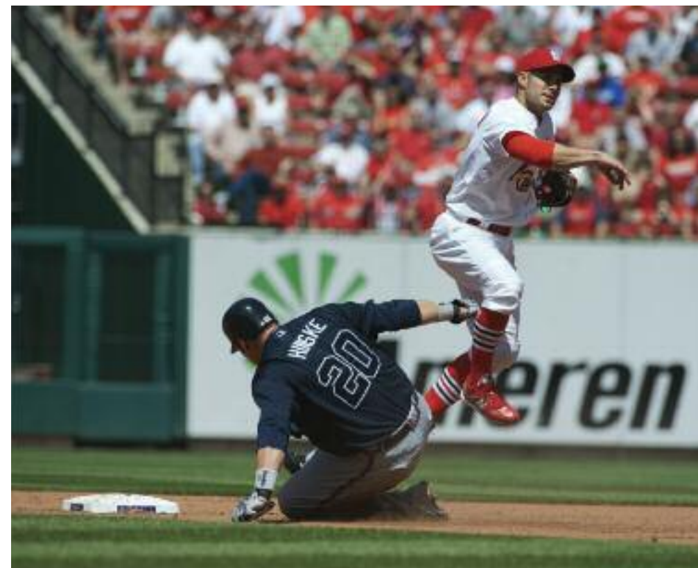
Skip Schumaker led all of MLB second basemen with 3.19 assists per game in 2010, and finished 5th in the National League with 359 assists.