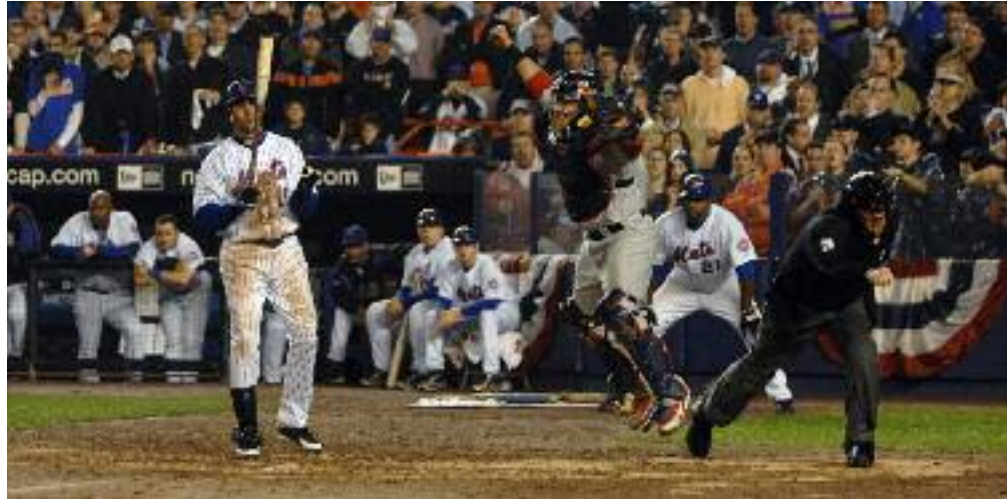
Catcher Yadier Molina reacts as Carlos Beltran is called out on strikes with the bases loaded for the final out in Game 7 of the 2006 NLCS.

Oct. 11 .....Cardinals at New York, rain Oct. 12 .....Cardinals 0, at New York 2 Oct. 13 .....Cardinals 9, at New York 6 Oct. 14 .....at Cardinals 5, New York 0 Oct. 15 .....at Cardinals 5, New York 12 Oct. 16 .....New York at Cardinals, rain Oct. 17 .....at Cardinals 4, New York 2 Oct. 18 .....Cardinals 2, at New York 4 Oct. 19 .....Cardinals 3, at New York 1