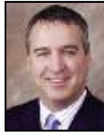
Craig Wilson Stadium Entertainment