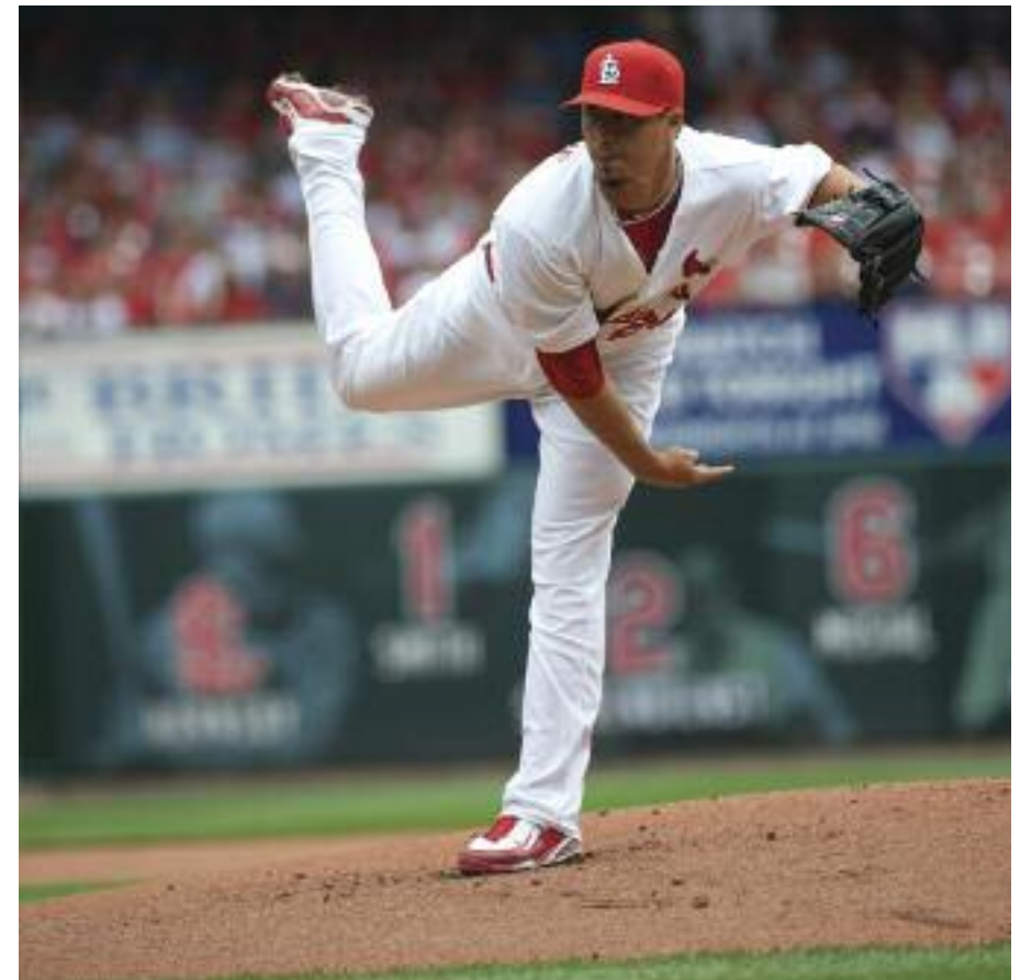
After mid-season arm surgery in 2010, Lohse improved over the final half of the season, pitching 7.0 scoreless innings in his last start, October 2, vs. Colorado.