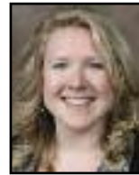
Raley Curry Ticket Sales