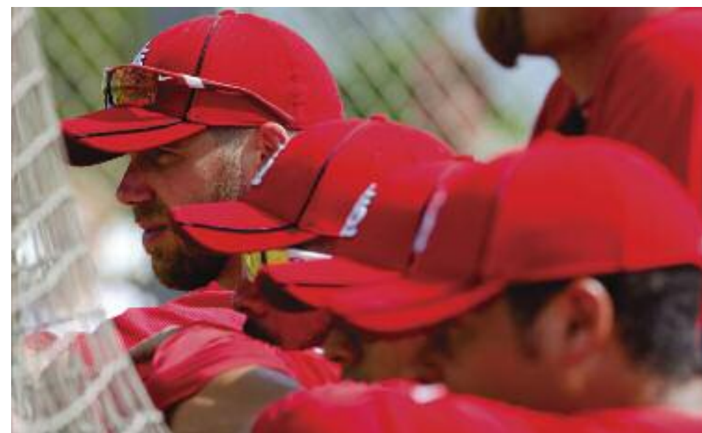
Cardinals pitchers keep a watchful eye on their teammates during spring training as they throw batting practice.

Most Hits: 2, 5/16/09 vs. Milwaukee. Most Runs: 1, 5/14/09 at Pittsburgh. Most 2Bs: 1, 5/10/09 at Cincinnati. Most RBI: 1, 5/14/09 at Pittsburgh. Longest Hitting Streak: 5 games, 5/10-16/09.