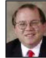
Larry State Publications