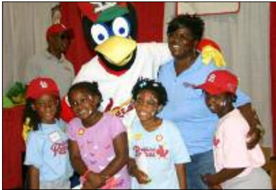
Rookies are invited to attend health fairs (above) where they learn to develop positive habits of eating right and staying active—and they get to hang out with Fredbird (left).

Redbird Rookies is the Cardinals Care youth development program that supports kids both on and off the baseball field. This special league provides all the uniforms, gloves, bats, balls and other equipment, as well as extensive off-field guidance in the areas of health, education, mentoring and cultural arts. Currently Redbird Rookies has 20 leagues, serving nearly 4,000 kids in the St. Louis area and parts of rural Missouri and Illinois.