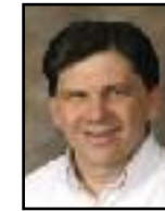
Tom House Accounting