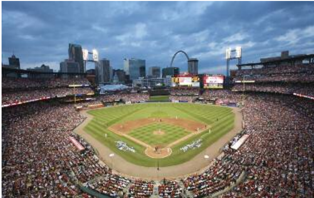
In 2009 the Cardinals and Busch Stadium hosted the MLB All-Star Game, the first time St. Louis had hosted the mid-summer classic since 1966.