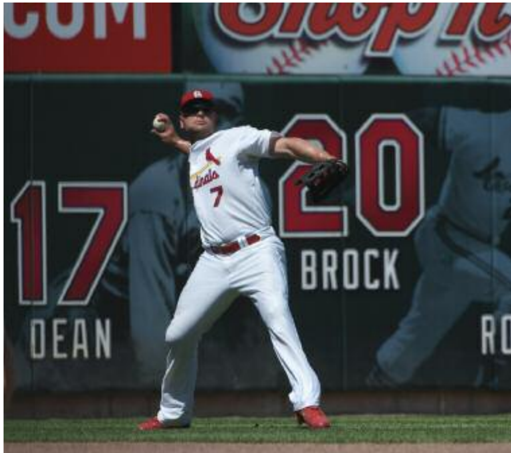
In 2010 Matt Holliday became the Cardinals everyday leftfielder, and was named to the National League All-Star Team and was an N.L. Silver Slugger winner.