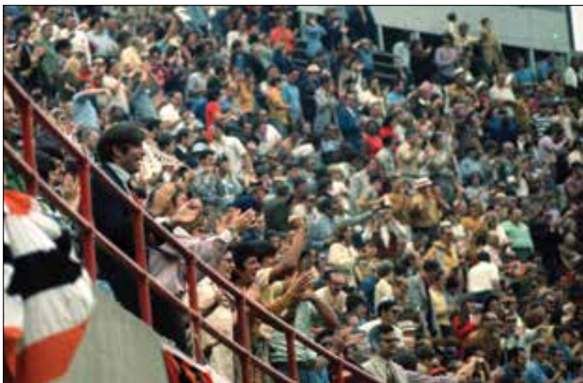
A packed Memorial Stadium saw the Orioles take a 2-0 lead in the 1971 Fall Classic.