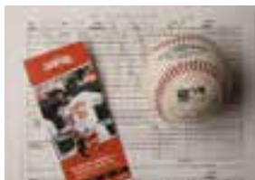
Ticket, ball and scorecard from the April 29, 2015 game at Camden Yards.