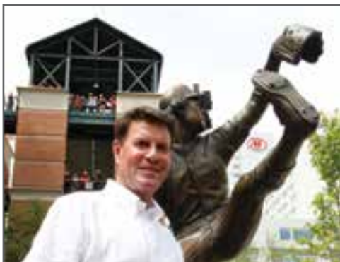
On July 14, 2012, a statue of Jim Palmer was unveiled in Legends Park at Camden Yards.