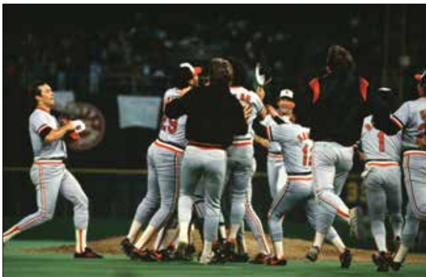
The Orioles celebrate after winning the 1983 World Series over the Philadelphia Phillies, 4-1.