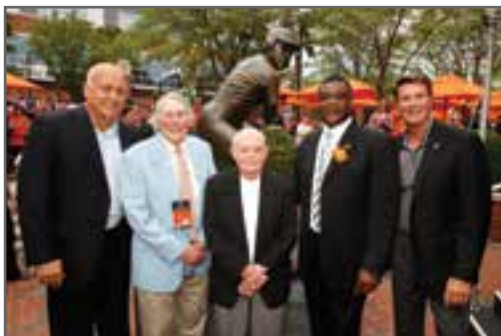
On August 11, 2012, a statue of Eddie Murray was unveiled in Legends Park at Camden Yards.