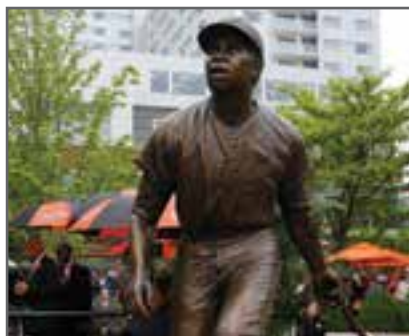
On April 28, 2012, a statue of Frank Robinson was unveiled in Legends Park at Camden Yards.