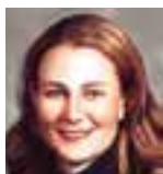
Pam Shriver Professional tennis player Network commentator