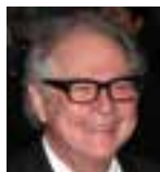
Barry Levinson Motion picture producer, writer and director