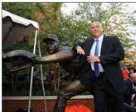
On September 6, 2012, a statue of Cal Ripken, Jr. was unveiled in Legends Park at Camden Yards.