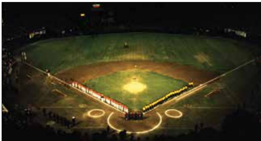
The O's knocked off the Angels in the ALCS before facing Pittsburgh in the World Series.