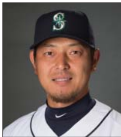
#18 • HISASHI IWAKUMA RHP