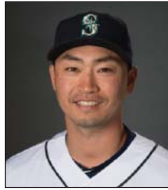
#8 • NORICHIKA AOKI OF