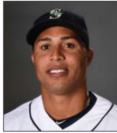
#12 • LEONYS MARTIN OF