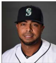
#23 • NELSON CRUZ OF