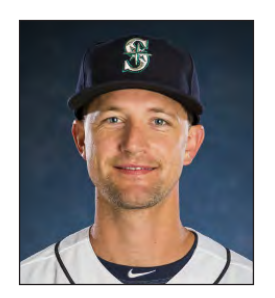
#8 • MIKE LEAKE RHP