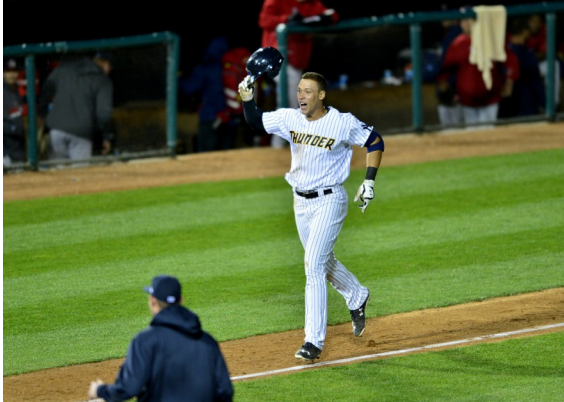
Aaron Judge (left) celebrates his 10th inning walk-off solo home run against the Portland Sea Dogs to cap off a 3-2 win in the Thunder's home opener on April 16, 2015.