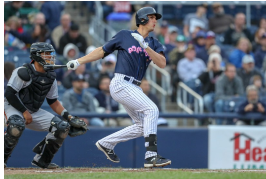
Yankees infielder Greg Bird knocked a solo home run as part of his five-game rehab assignment with the Thunder in 2018.

Since the Thunder's inaugural season in 1994, a total of 376 former Thunder players and coaches have reached the Major League level at some point in their career.