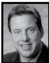
William Clay Ford, Jr.