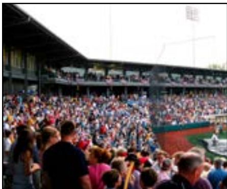
The Miners' inaugural season of 2007 set a Frontier League attendance record of 259,392 fans for the season, an average of 5,086 per game. Both records still stand to this day.

2007 - 259,392 (1st; league record) 2008 - 218,198 (1st) 2009 - 209,477 (1st) 2010 - 204,181 (2nd) 2011 - 181,576 (1st) 2016 - 153,940 (3rd) 2017 - 151,521 (2nd) 2015 - 151,503 (2nd) 2014 - 147,287 (3rd) 2012 - 129,936 (3rd) 2013 - 126,084 (6th) 2018 - 109,691 (3rd) 2019 - 101,441 (4th)