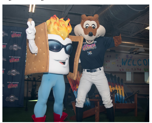
Toasty and Sox the Fox meet for the first time!

We got right to work with the new team name, drawing up logos for the upcoming season. The unveiling for our logos came in November of 2018 when the world was first exposed to our rebrand. Then the