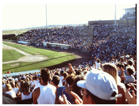
Game at Sky Sox Stadium in 1989

July 17th, 2018: The Sky Sox game on Tuesday, July 17th vs. Round Rock was the 100th game at Security Service Field where both teams scored 10 runs or more in the same game, with Colorado Springs coming out on top in an 11-10 final. In contrast, there have been only 14 games at the stadium with a 1-0 final.