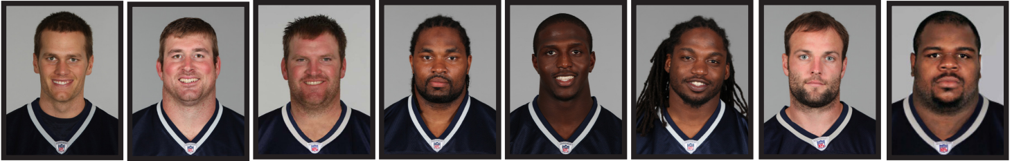
TOM BRADY PRO BOWL STARTER 6 TH CAREER SELECTION MATT LIGHT PRO BOWL RESERVE 3 RD CAREER SELECTION LOGAN MANKINS PRO BOWL STARTER 3 RD CAREER SELECTION JEROD MAYO PRO BOWL RESERVE 1 ST CAREER SELECTION DEVIN MCCOURTY PRO BOWL RESERVE 1 ST CAREER SELECTION BRANDON MERIWEATHER PRO BOWL RESERVE 2 ND CAREER SELECTION WES WELKER PRO BOWL RESERVE 3 RD CAREER SELECTION VINCE WILFORK PRO BOWL STARTER 3 RD CAREER SELECTION

BRADY, MANKINS, WILFORK SELECTED AS STARTERS; LIGHT, MAYO, MCCOURTY, MERIWEATHER, WELKER AS RESERVES