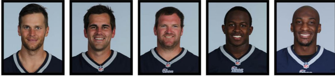
Tom Brady 9th Selection Stephen Gostkowski 2nd Selection Logan Mankins 6th Selection Matthew Slater 3rd Selection Aqib Talib 1st Selection

Five members of the New England Patriots have been selected to the 2014 NFL Pro Bowl. Quarterback Tom Brady, K Stephen Gostkowski, G Logan Mankins, WR Matthew Slater (special teams) and CB Aqib Talib have been selected to represent the New England Patriots in the 2014 NFL Pro Bowl on Jan. 26, 2014 at Aloha Stadium in Hawaii.