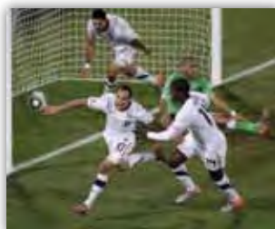
Landon Donovan scores game winning goal against Algeria in 2010 FIFA World Cup