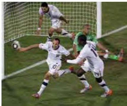
Landon Donovan scores game winning goal against Algeria in 2010 FIFA World Cup

For more information on all U.S. Soccer programs, visit the official organization website at ussoccer.com .