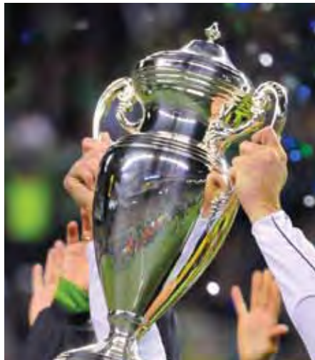
The Dewar Cup is awarded to the tournament champion

Orlando's run also came to an end in the quarterfinals as the Chicago Fire pulled away for victory at Toyota Park. The Lions' run, however, made them the fifth different USL PRO side to reach the quarterfinals in the past three seasons as they joined the Harrisburg City Islanders, Charlotte Eagles, Dayton Dutch Lions and Richmond Kickers in achieving the feat.