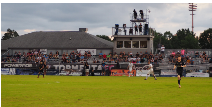
Erk Russell Park