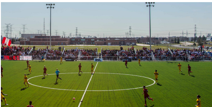
BMO Ontario Soccer Centre