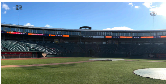
Cooley Law School Stadium