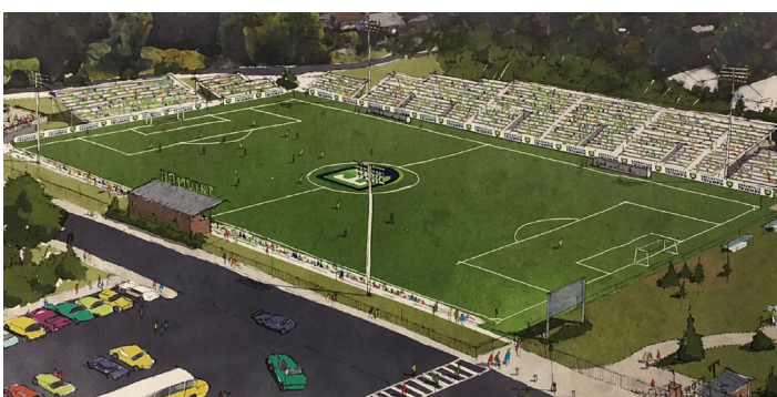
Legacy Early College