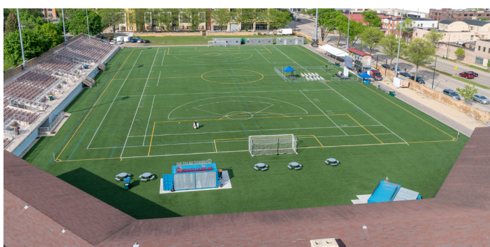
Breese Stevens Field