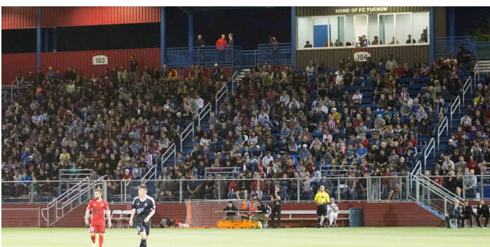
Kino Sports Park