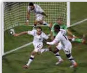
Landon Donovan scores game winning goal against Algeria in 2010 FIFA World Cup