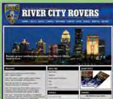
RIVER CITY ROVERS