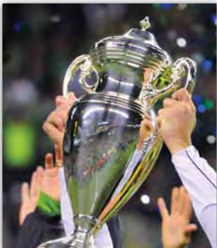
The Dewar Cup is awarded to the tournament champion