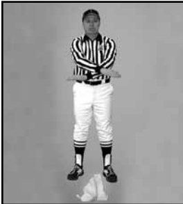
NO FLAG ON PLAY drop flag on ground & swing arms at hip level