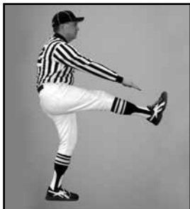
CONTACTING THE KICKER touch raised leg below knee