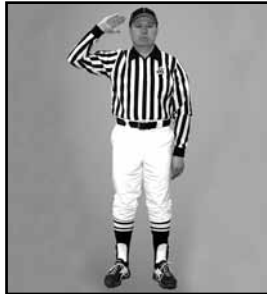
ROUGHING THE PASSER passing motion