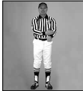
DISQUALIFICATION chopping action on wrist