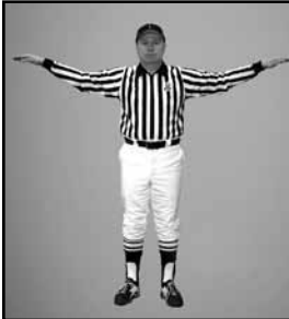
INELIGIBLE RECEIVER both arms extended sideways