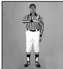
ILLEGAL PASS horizontal arc of arm