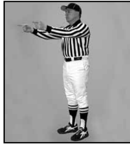
COIN TOSS WINNER pointing with both arms towards the team that won the toss