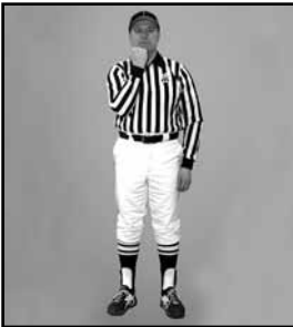
FACEMASK clenched fist at face level