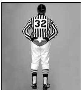
DELAY OF GAME both hands behind back