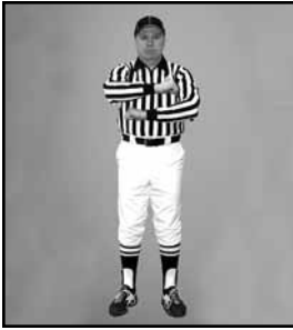
ILLEGAL PROCEDURE hands rotating in forward motion