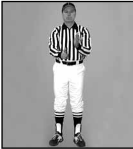
PILING ON vertical chopping motion with both hands