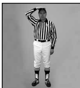
ILLEGAL SUBSTITUTION one hand on top of head