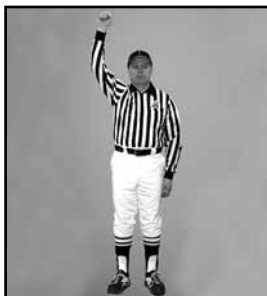
FORWARD PASS BEHIND LINE OF SCRIMMAGE raise arm above head