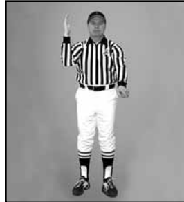
INTENTIONAL GROUNDING passing motion & pointing at ground