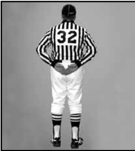
DELAY OF GAME both hands behind back