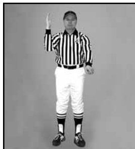
INTENTIONAL GROUNDING passing motion & pointing at ground