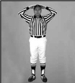
TOO MANY PLAYERS both hands on top of head