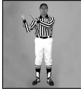
CUT OR CHOP BLOCK horizontal chopping motion