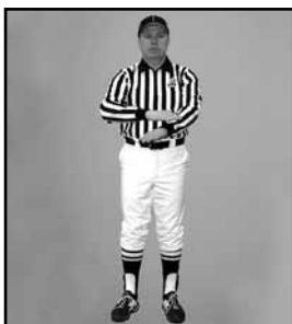
RESETTING THE 20-SECOND CLOCK a stroking motion of the forearm