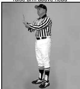
ILLEGAL BLOCK arm extended & grasp wrist