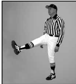
ROUGHING THE KICKER kicking motion