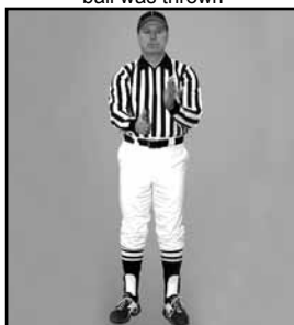
PILING ON vertical chopping motion with both hands