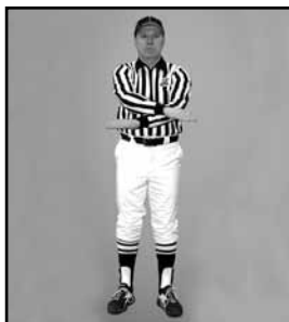
PENALTY DECLINED swinging arms at hip level