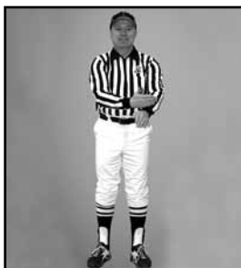
DISQUALIFICATION chopping action on wrist