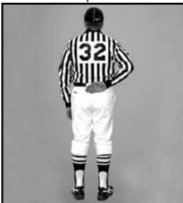
OBJECTIONABLE CONDUCT one hand behind back