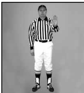
ILLEGAL CONTACT ON A RECIEVER one arm extended with open hand