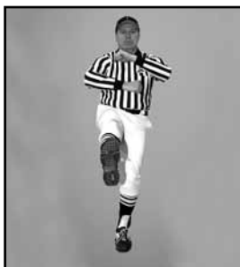
ILLEGAL KICKOFF hands rolling in forward motion followed by swinging leg