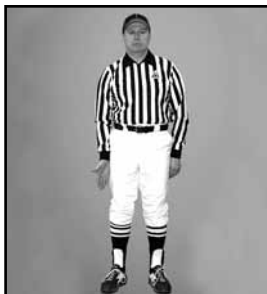
ILLEGAL CRACKBACK striking thigh with open hand