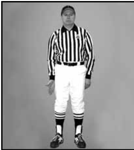
ILLEGAL CRACKBACK striking thigh with open hand