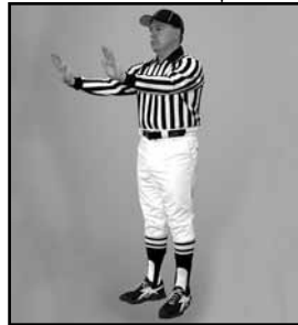
ILLEGAL INTERFERENCE pushing arms forward from shoulders