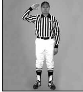
ROUGHING THE PASSER passing motion