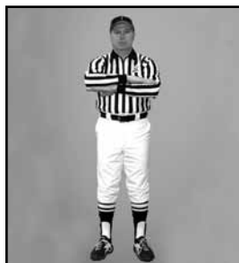
NO YARDS arms folded at chest