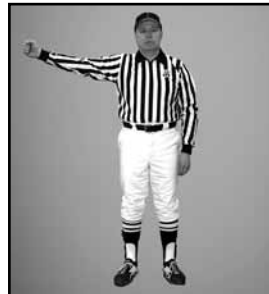
UNNECESSARY ROUGHNESS pumping motion of arm sideways