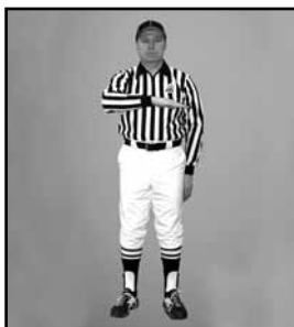
ILLEGAL PASS horizontal arc of arm