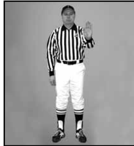
ILLEGAL CONTACT ON A RECIEVER one arm extended with open hand