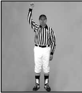
FORWARD PASS BEHIND LINE OF SCRIMMAGE raise arm above head