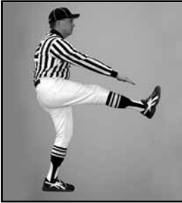
CONTACTING THE KICKER touch raised leg below knee