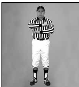
ILLEGAL PROCEDURE hands rotating in forward motion