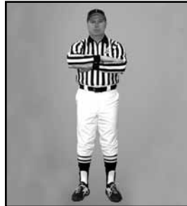
NO YARDS arms folded at chest