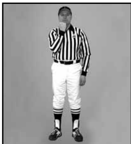
FACEMASK clenched fist at face level