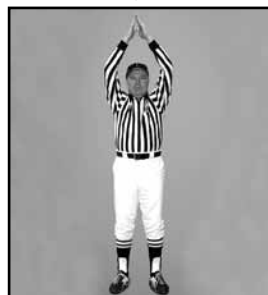
SAFETY TOUCH palms together above head