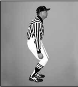
CLIPPING striking back of knees