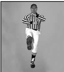
ILLEGAL KICKOFF hands rolling in forward motion followed by swinging leg