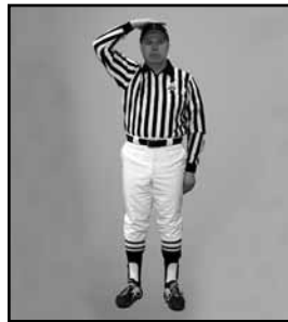
ILLEGAL SUBSTITUTION one hand on top of head