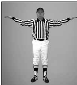
INELIGIBLE RECEIVER both arms extended sideways