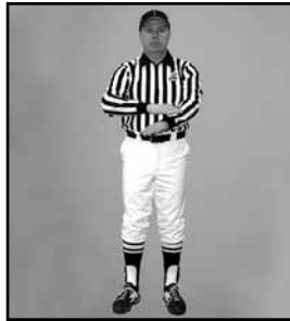
RESETTING THE 20-SECOND CLOCK a stroking motion of the forearm