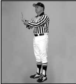
ILLEGAL BLOCK arm extended & grasp wrist