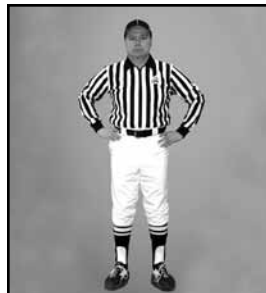
OFFSIDE hands on hips