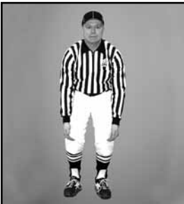
TRIPPING chopping action on both knees