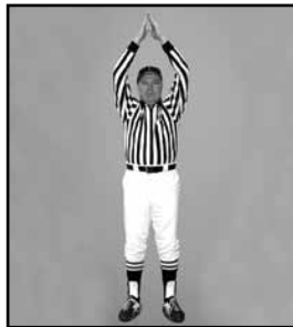
SAFETY TOUCH palms together above head