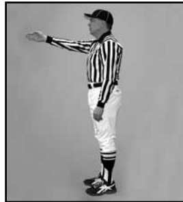
FIRST DOWN AWARDED arm pointed forward