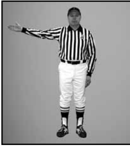
ONSIDE OR LATERAL PASS pointing in the direction the ball was thrown