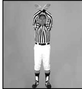
TIME OUT hands crossed above head