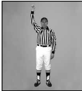
SINGLE POINT one arm extended above head & indicating 1 point