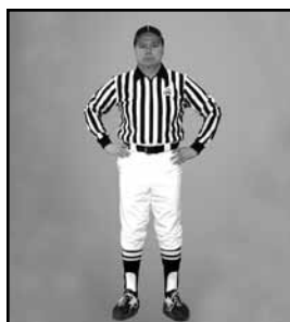
OFFSIDE hands on hips