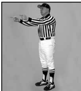
COIN TOSS WINNER pointing with both arms towards the team that won the toss