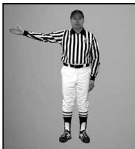
ONside OR Lateral PASS pointing in the direction the ball was thrown