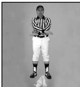
NO FLAG ON PLAY drop flag on ground & swing arms at hip level