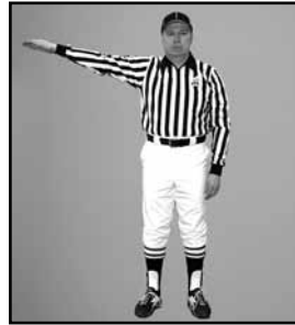
TIME COUNT VIOLATION arm extended moving in circular motion