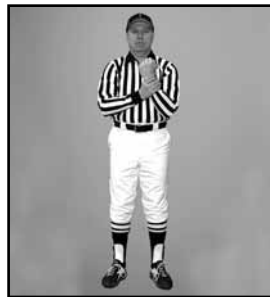
HOLDING grasping wrist at chest level