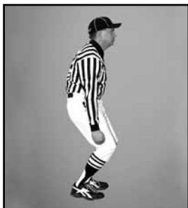
CLIPPING striking back of knees