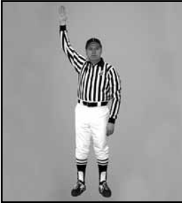
TIME IN downward rotation of arm