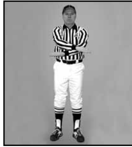
PENALTY DECLINED swinging arms at hip level