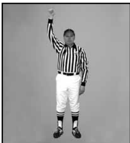
SINGLE POINT one arm extended above head & indicating 1 point