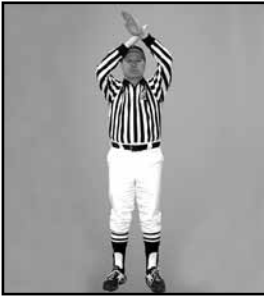
SPEARING chopping motion above head