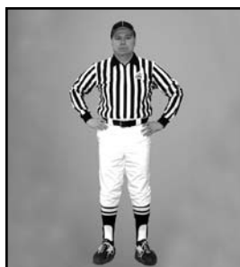
OFFSIDE hands on hips