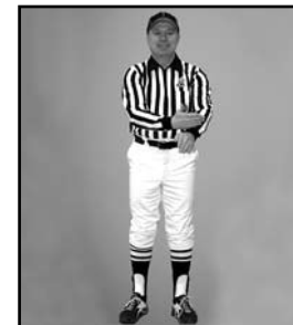
DISQUALIFICATION chopping action on wrist