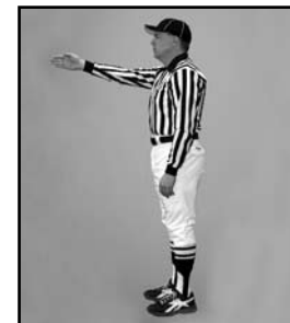
FIRST DOWN AWARDED arm pointed forward