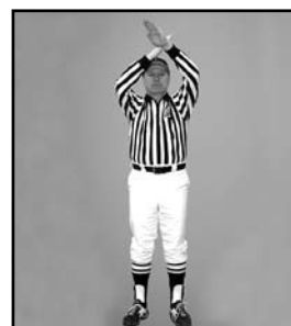
SPEARING chopping motion above head