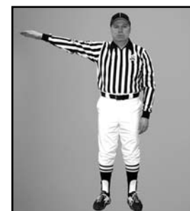
TIME COUNT VIOLATION arm extended moving in circular motion