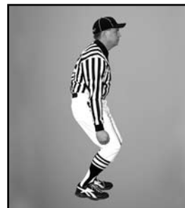
CLIPPING striking back of knees