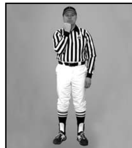
FACEMASK clenched fist at face level