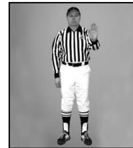
ILLEGAL CONTACT ON A RECEIVER one arm extended with open hand