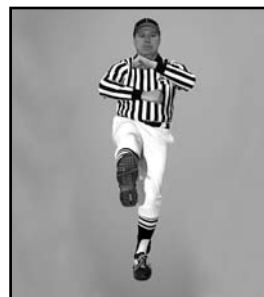
ILLEGAL KICKOFF hands rolling in forward motion followed by swinging leg