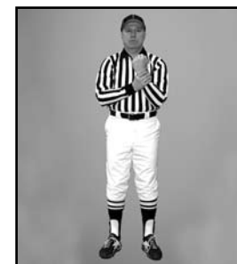
HOLDING grasping wrist at chest level