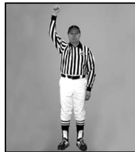
FORWARD PASS BEHIND LINE OF SCRIMMAGE raise arm above head