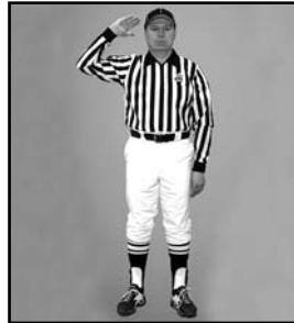
ROUGHING THE PASSER passing motion