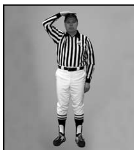
ILLEGAL SUBSTITUTION one hand on top of head