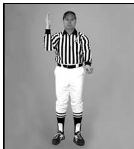
INTENTIONAL GROUNDING passing motion & pointing at ground