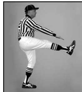
CONTACTING THE KICKER touch raised leg below knee