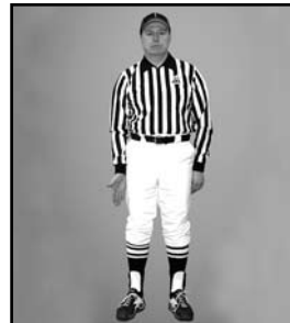
ILLEGAL CRACKBACK striking thigh with open hand