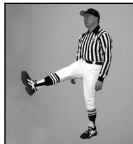
ROUGHING THE KICKER kicking motion