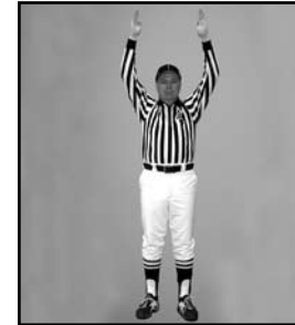
TOUCHDOWN OR FIELD GOAL both arms raised towards sky