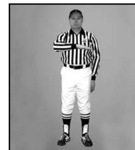
ILLEGAL PASS horizontal arc of arm