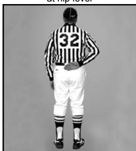
OBJECTIONABLE CONDUCT one hand behind back