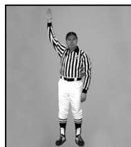
TIME IN downward rotation of arm