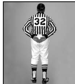
DELAY OF GAME both hands behind back