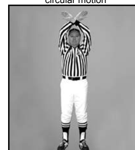
TIME OUT hands crossed above head