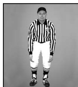
TRIPPING chopping action on both knees