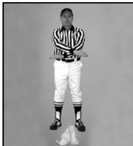
NO FLAG ON PLAY drop flag on ground & swing arms at hip level