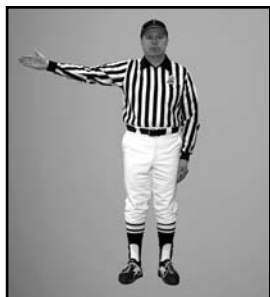
ONSIDE OR LATERAL PASS pointing in the direction the ball was thrown