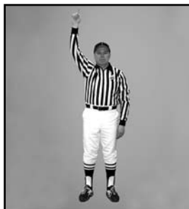
SINGLE POINT one arm extended above head & indicating 1 point