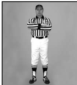
NO YARDS arms folded at chest