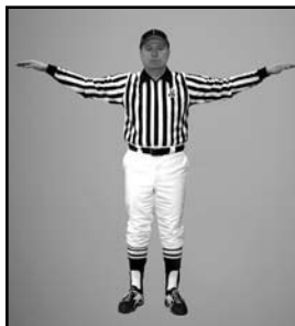
INELIGIBLE RECEIVER both arms extended sideways