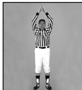
SAFETY TOUCH palms together above head