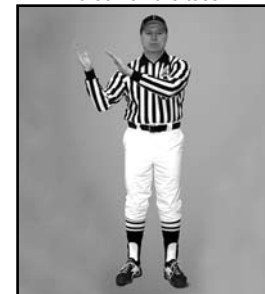
CUT OR CHOP BLOCK horizontal chopping motion