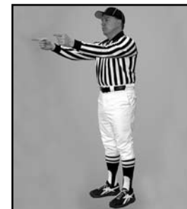
COIN TOSS WINNER pointing with both arms towards the team that won the toss