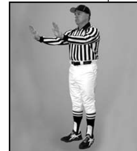
ILLEGAL INTERFERENCE pushing arms forward from shoulders