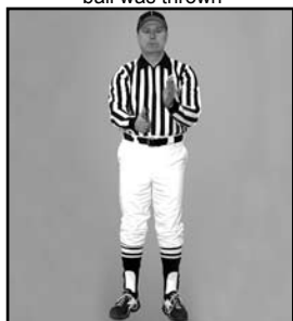
PILING ON vertical chopping motion with both hands