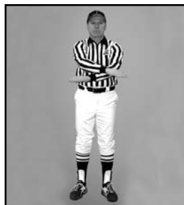
PENALTY DECLINED swinging arms at hip level