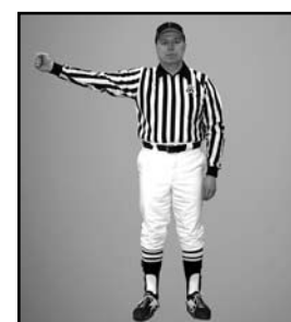
UNNECESSARY ROUGHNESS pumping motion of arm sideways