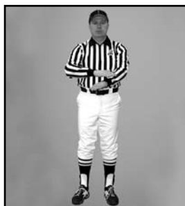
RESETTING THE 20-SECOND CLOCK a stroking motion of the forearm