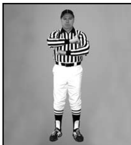
ILLEGAL PROCEDURE hands rotating in forward motion