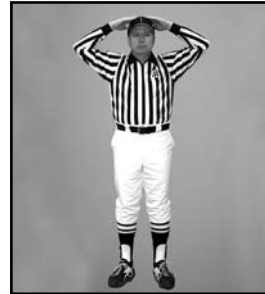
TOO MANY PLAYERS both hands on top of head