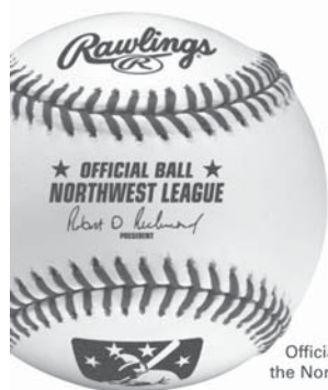
Official Baseball of the Northwest League

One ball is used exclusively by the best in the game. Each of the 108 stitches are hand sewn to ensure the quality and perfection those players demand. It takes heart to be the best, and only the best can be the heart of the game.