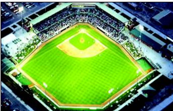
Lincoln's Haymarket Park won the American Association's "Playing Field of the Year" award in 2011. The field has won the award every season since 2006.