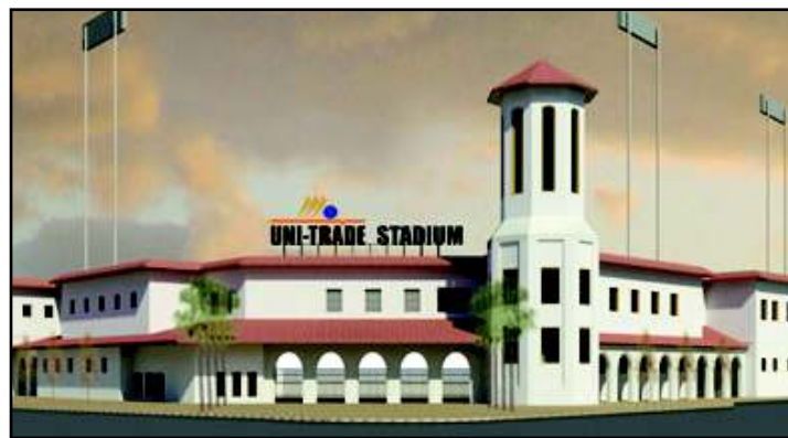
The Laredo Lemurs begin their 2012 inaugural season at brand-new $18 million Uni-Trade Stadium.

Championship Series Other first round winner at team with best winning percentage (if necessary)