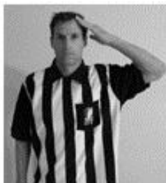
DANGEROUS CONTACT TO HEAD