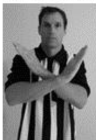
INTERFERENCE w/ GOALTENDER