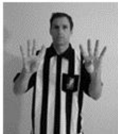
2 SECOND COUNT