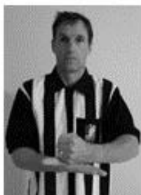
INTENTIONAL DEAD BALL CONTACT