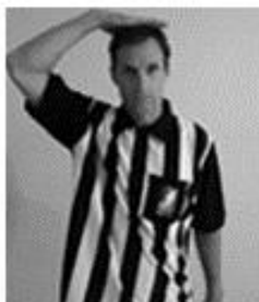
SHOT CLOCK VIOLATION