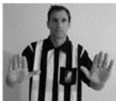
CHECKING FROM BEHIND