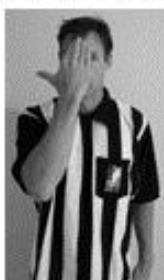
HEAD BUTTING / SPEARING WITH HEAD