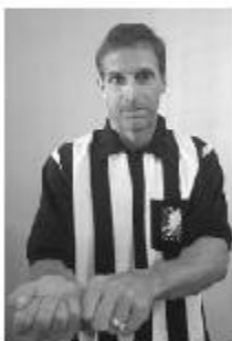
NO GOAL: BALL BATTED IN