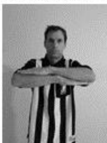
ILLEGAL SUB TOO MANY MEN