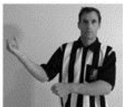
HOLDING THE STICK