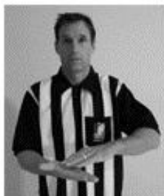
HANDLING THE BALL