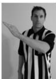
OVER AND BACK VIOLATION