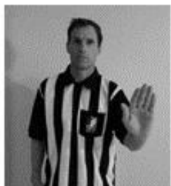
LOOSE BALL PUSH