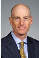
Jim Furyk (2014) Ponte Vedra Beach, Florida