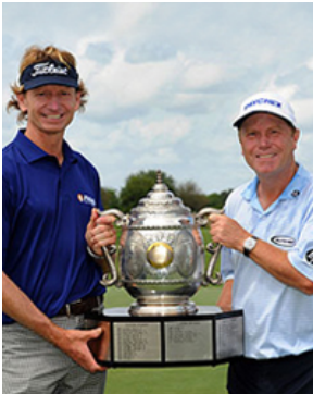
Winner: Brad Faxon, Jeff Sluman $460,000.00 62-66-65 193 (-23)