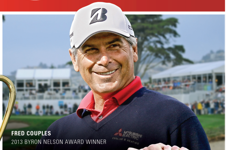
FRED COUPLES 2013 BYRON NELSON AWARD WINNER