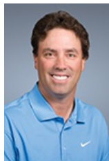
Stephen Ames 2014