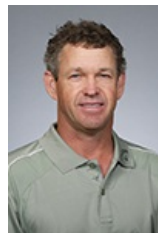
Lee Janzen 2014