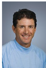
Billy Andrade 2014