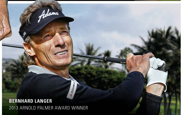
BERNHARD LANGER 2013 ARNOLD PALMER AWARD WINNER