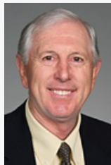
Hale Irwin Paradise Valley, Arizona