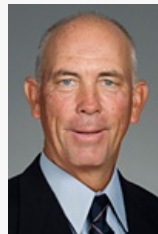
Tom Lehman Scottsdale, Arizona