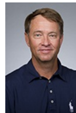
Davis Love III 2014

The following international players will turn 50 in the coming years: