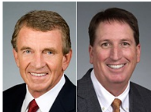
Tim Finchem Commissioner