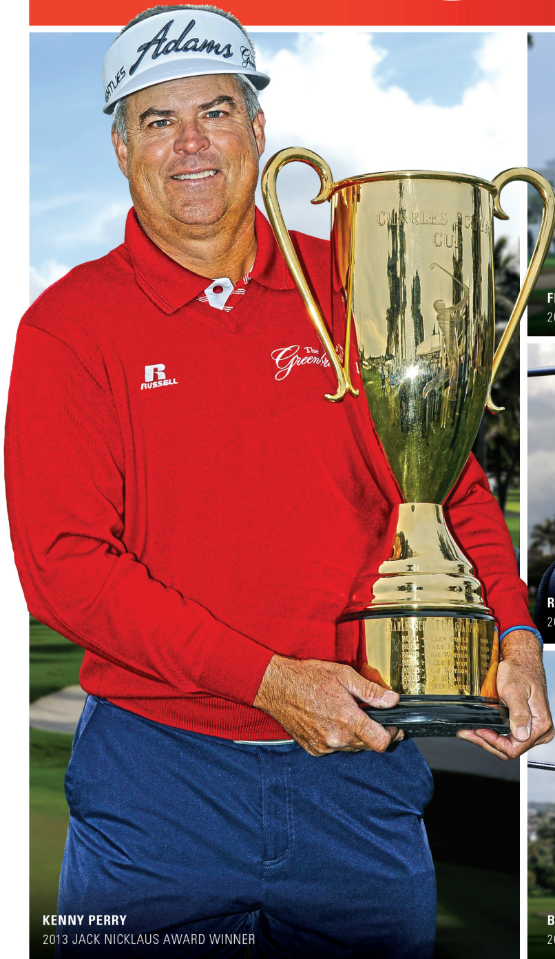
KENNY PERRY 2013 JACK NICKLAUS AWARD WINNER