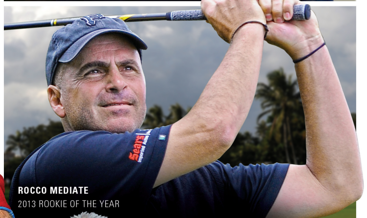
ROCCO MEDIATE 2013 ROOKIE OF THE YEAR