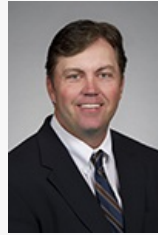
Bo Van Pelt (2014) Tulsa, Oklahoma