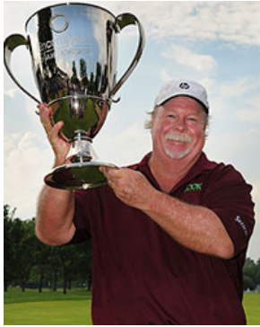
Winner: Craig Stadler $270,000.00 67-65-71 203 (-13)