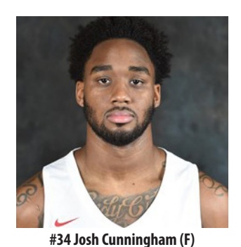
Available Player Pool