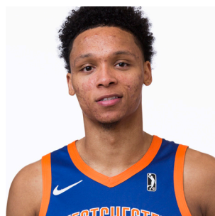
#25 Ivan Rabb (F) Two-Way (NYK)