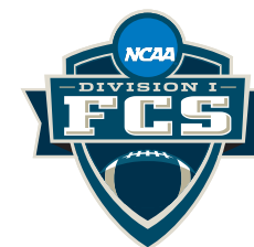
2.75" x 2.85" FCS LOGO SIZE