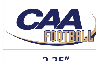
2.25" JERSEY AND PANTS LOGO SIZE

Note: When a manufacturer's logo presents a conflict with the preferred logo placement, the alternative options for placement are denoted by the blue dashed rectangle.