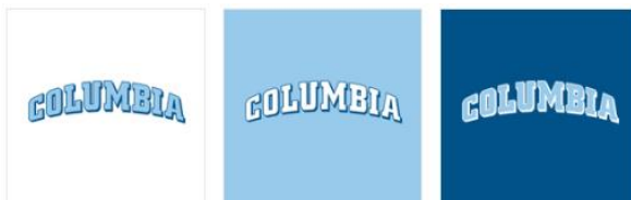
305_COLU Columbia Arch