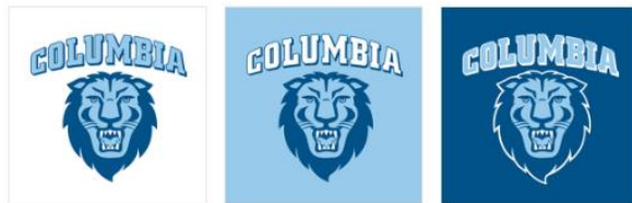
302_COLU Columbia Lion