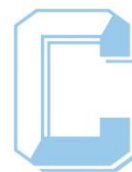
307_COLU Split C