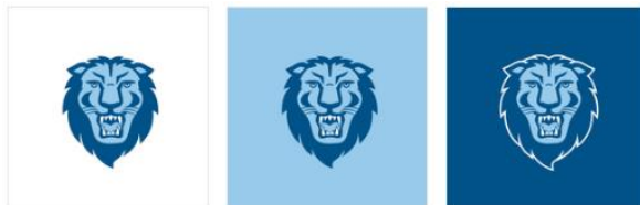
303_COLU Lion Head