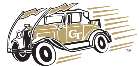
Pantone Process Black C