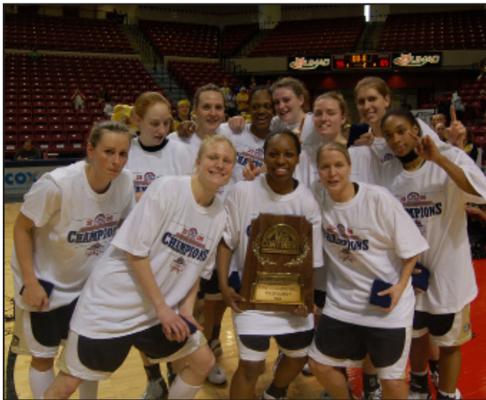
In the 2001-02, Oakland claimed its first Mid-Con Tournament title in the Division I era