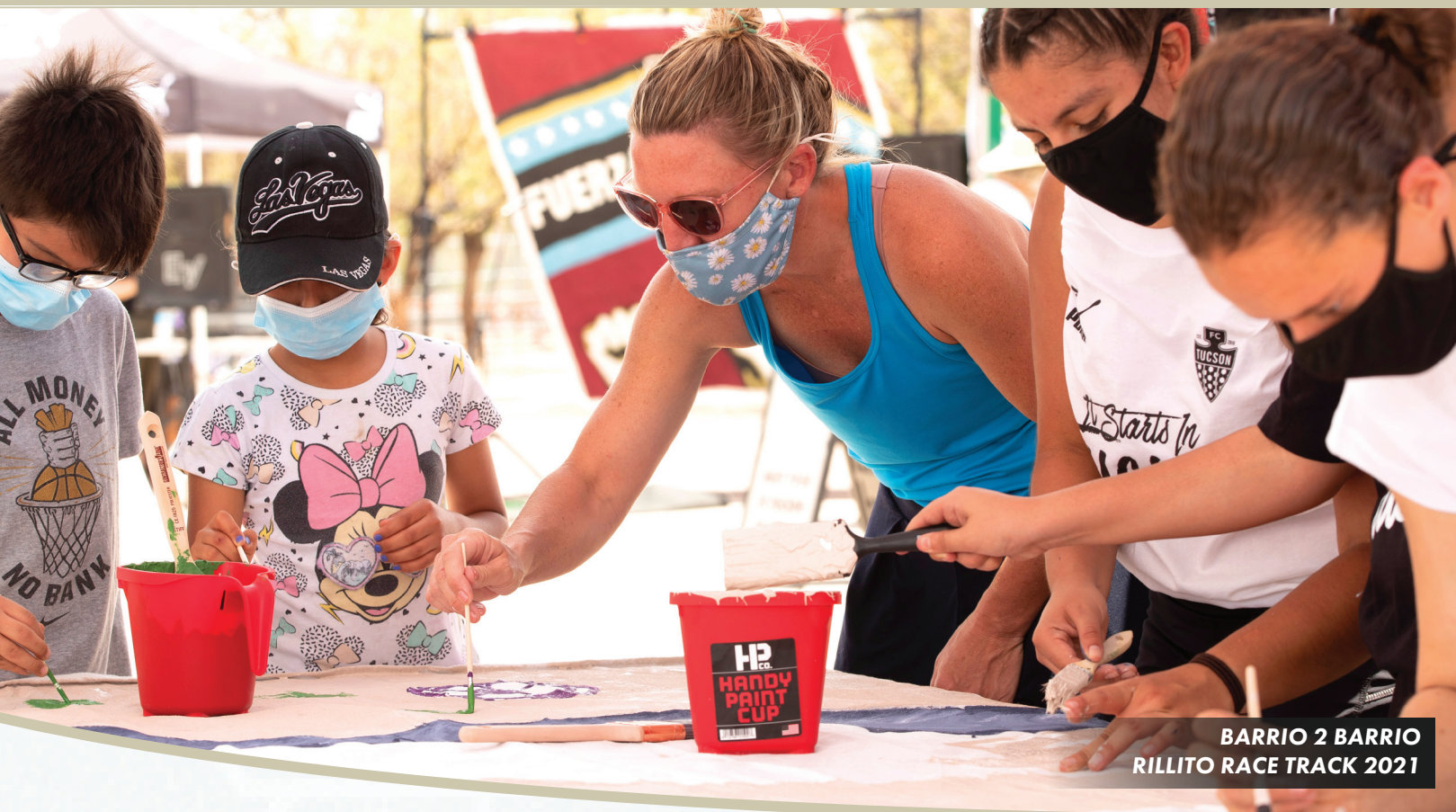
BARRIO 2 BARRIO RILLITO RACE TRACK 2021