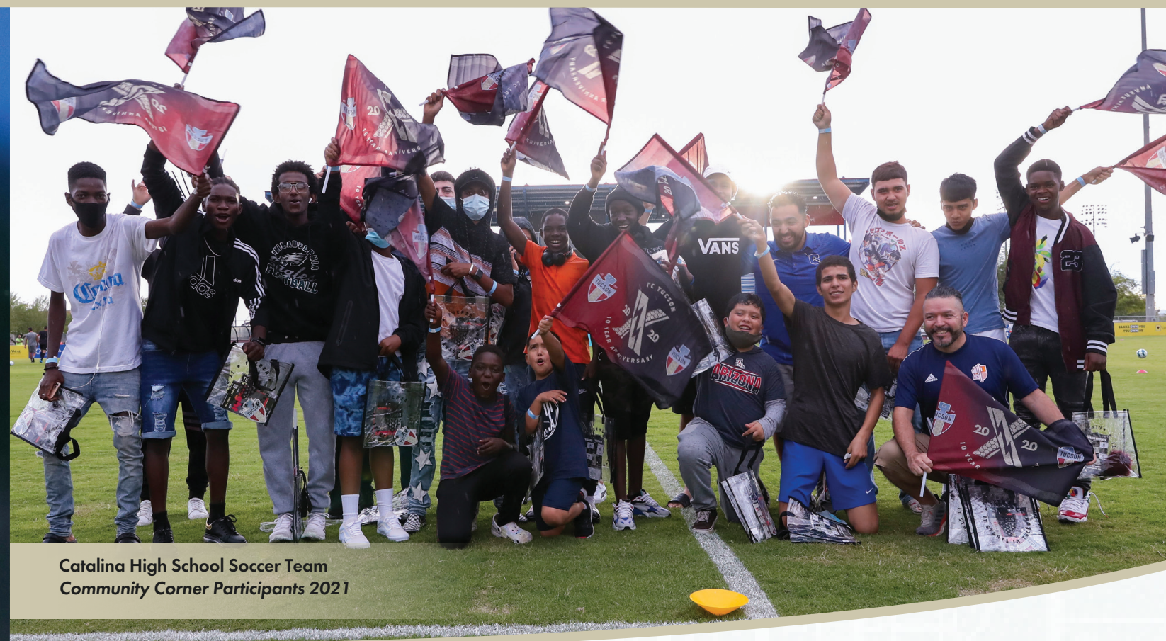
Catalina High School Soccer Team Community Corner Participants 2021