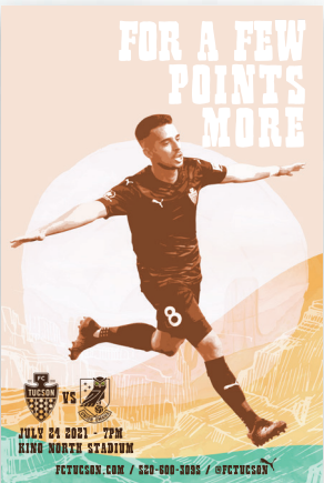
MATCH DAY POSTERS