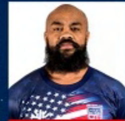
4 | API NAIKATINI