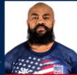
4 | API NAIKATINI