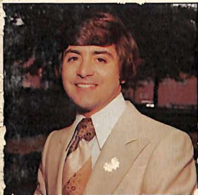
Edward J. DeBartolo, Jr. President