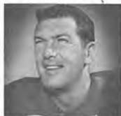
Bob St. Clair-1963