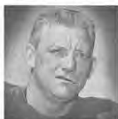
John David Crow-1966