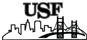
Secondary Mark 1982-2000