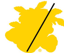
Do not use the logo as a silhouette.