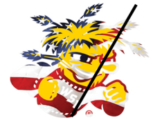
Do not fill the logo with a pattern or any other elements.