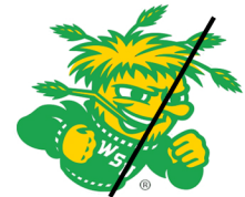
Do not change any colors within the logo.