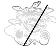
Do not use a gradient or color overlay.