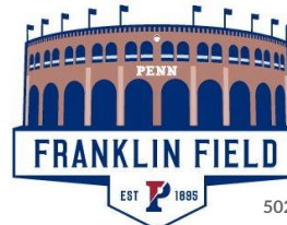
502_PENN Franklin Field

The University of Pennsylvania's marks are controlled under a licensing program administered by Exemplar Associates.