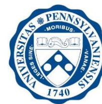
105_PENN Shield Circle