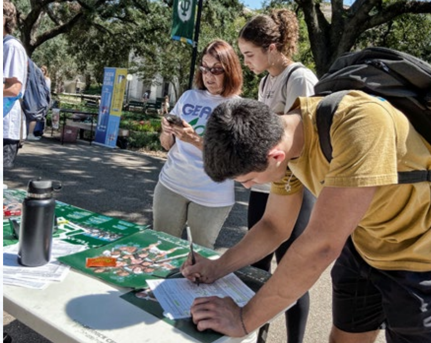
Tulane Athletics takes part in voter registration drives on campus.