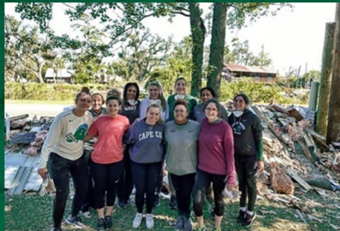
Members of Women's Basketball, Track and Field, and Women's Bowling helping with Hurricane Ida relief at the Pointe Au Chein Indian Tribe