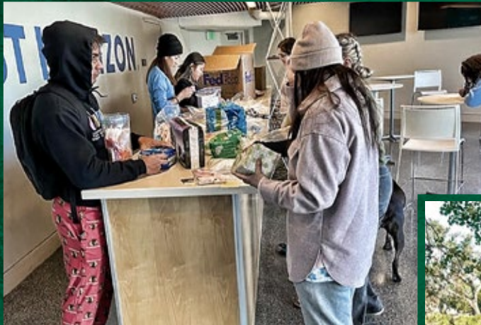
Student-athletes participating in a day of service for HerDrive.