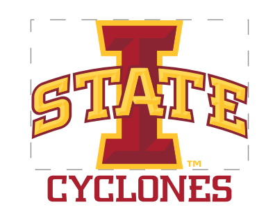
Supplemental text must not intrude into the mark's crop space.