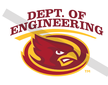
Never alter typography.