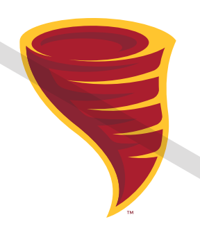
Never flip the logo.