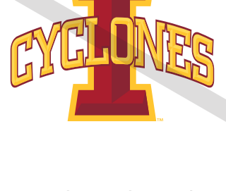
Do not change the wording.