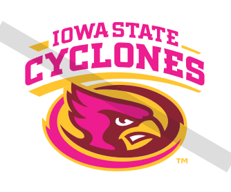
Never use unapproved colors.