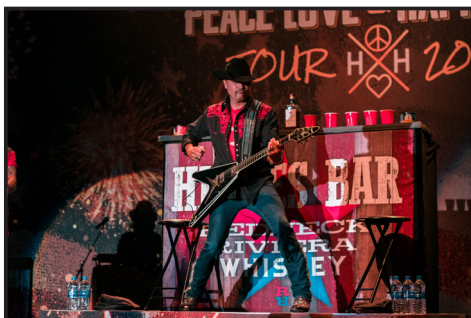
Big & Rich ('19)

Located in downtown Midland, Dow Diamond is more than just a stadium. A year-round facility with elegant rooms and unique views Dow Diamond turns any event into a memorable occasion. Dow Diamond's full-time catering department has extensive menus and drink options for parties of 25 to over 1,000. With a management staff experienced in executing events of all sizes, Dow Diamond's special events deliver exceptional results from concept to finish. To reserve your spot for a trade shows, celebrations, charity events, graduation parties and more, contact Dave Gomola by calling 989.837.6146 or emailing dgomola@loons.com .