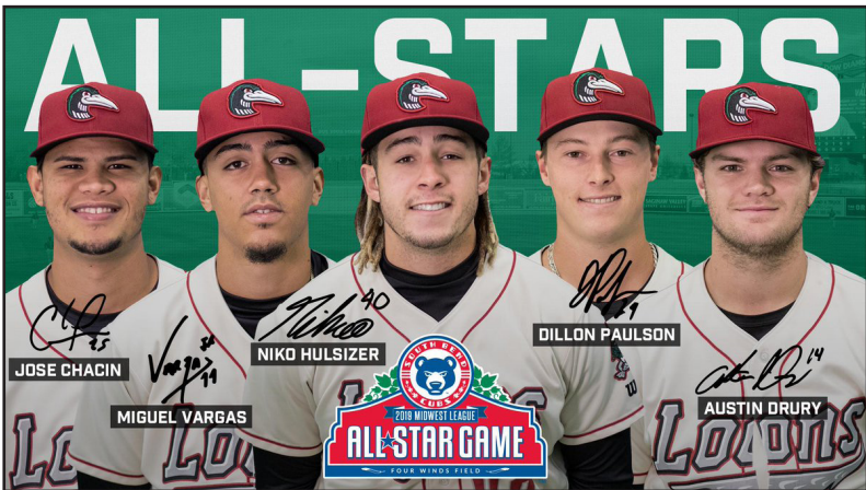
Loons' 2019 Midwest League All-Stars.