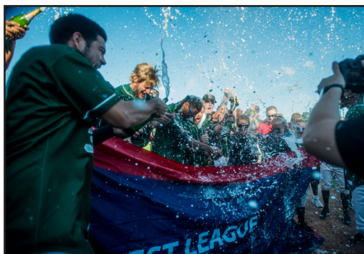
Loons celebrated their first MWL title in 2016.