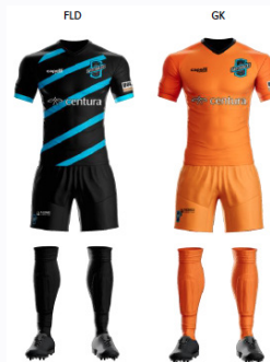
Colorado Springs Switchbacks FC