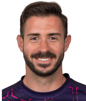
KOKE VEGAS 25 | GOALKEEPER