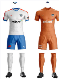
Rio Grande Valley FC Toros